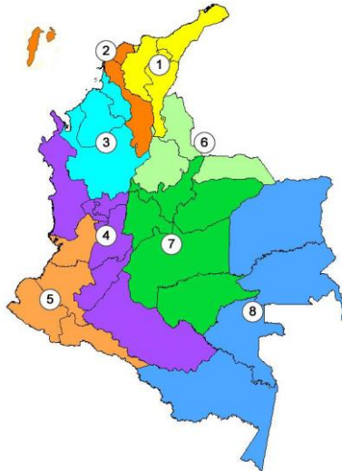
Figure 3 Division of logistic distribution Macro-Regions (MR)

The Bienestarina supply chain uses different mechanisms and means of transport (land, air, and sea) to bring the product to remote parts of the country and achieve full coverage of the territory as shows the Table 2.