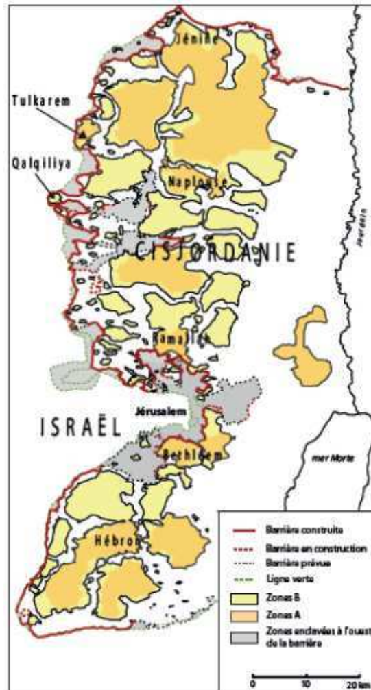
Map 1: A, B and C zones in the West Bank

In 2000, on the eve of the Second Intifada, the A zones covered 17% and the B zones 23% of the region.