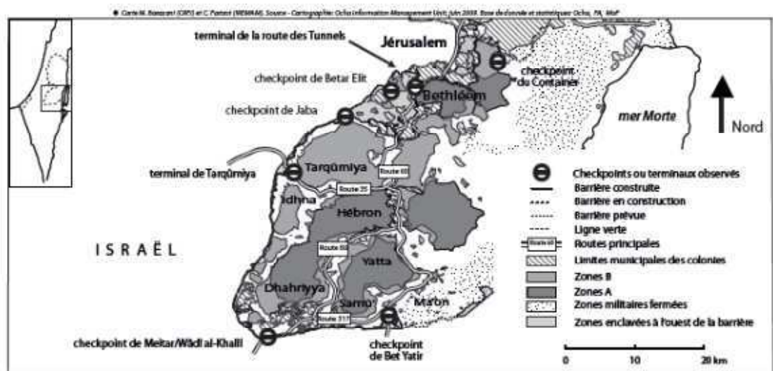
Carte 4 principaux terminaux et checkpoints entre le sud de la Cisjordanie et Israël

Lastly, the considerable distance between the checkpoints and the destination of the goods – Palestinian enclaves or Israeli settlements – and the fact that traders handle both Israeli and Palestinian goods means that they can switch from the very tightly controlled system imposed on Palestinian goods to the much freer system designed for Israeli products. The example of Sâlim as-Sharârke 11 is particularly illuminating: a resident of Yatta, he built his house in 2007. At that time the steel used in the building industry was cheaper in Israel than in the Palestinian Territories. Sâlim ash-Sharârke therefore bought several tonnes of steel from an Israeli entrepreneur in Beersheba, Moshe Azoulay, who drew up a bogus invoice made out to an Israeli living in the settlement of Ma'on which is south of the Palestinian town of Yatta (see map 4).