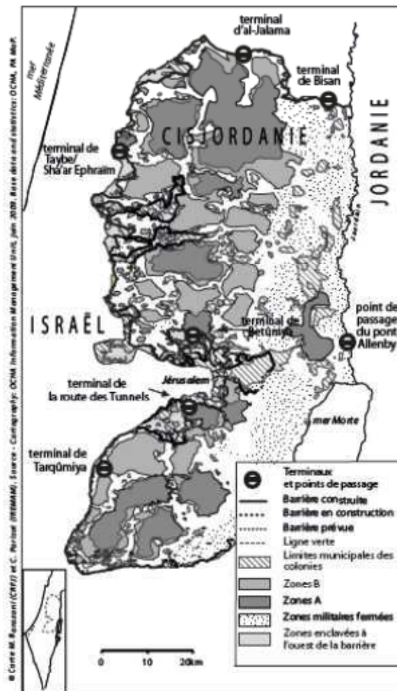
Carte 3: Points de passage destinés au traitement des marchandises entre Israël, la Cisjordanie et la Jordanie