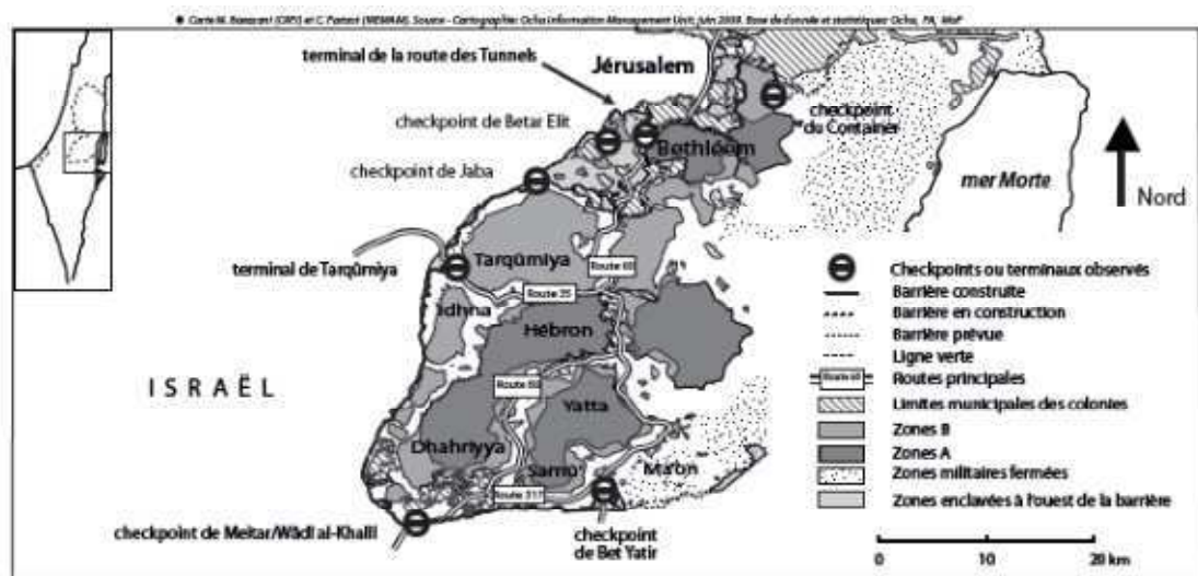
Carte 4 principaux terminaux et checkpoints entre le sud de la Cisjordanie et Israël

Lastly, the considerable distance between the checkpoints and the destination of the goods – Palestinian enclaves or Israeli settlements – and the fact that traders handle both Israeli and Palestinian goods means that they can switch from the very tightly controlled system imposed on Palestinian goods to the much freer system designed for Israeli products. The example of Sâlim as-Sharârke 11 is particularly illuminating: a resident of Yatta, he built his house in 2007. At that time the steel used in the building industry was cheaper in Israel than in the Palestinian Territories. Sâlim ash-Sharârke therefore bought several tonnes of steel from an Israeli entrepreneur in Beersheba, Moshe Azoulay, who drew up a bogus invoice made out to an Israeli living in the settlement of Ma'on which is south of the Palestinian town of Yatta (see map 4).