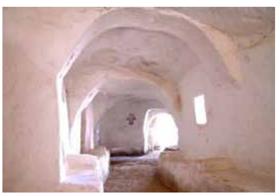
Figure 5: Examples of the covered alleys at the ground floor level.

rises above the roof. Each terrace is enclosed by low parapet walls. In the corners, these walls rise up in the sky to form small fortified points, the 'ears', that can rise 1 m above the main wall level.