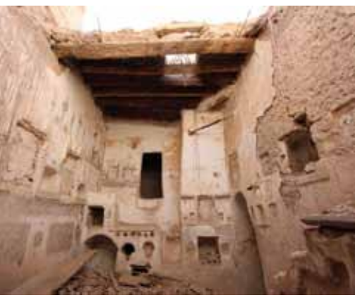
Figure 2: Abandoned houses.