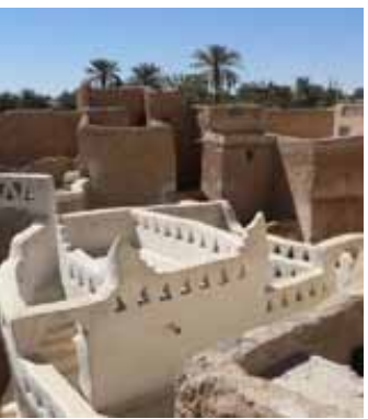
Figure 4: Examples of terraces. Left: © Thierry Joffroy; right: © Sebastien Moriset