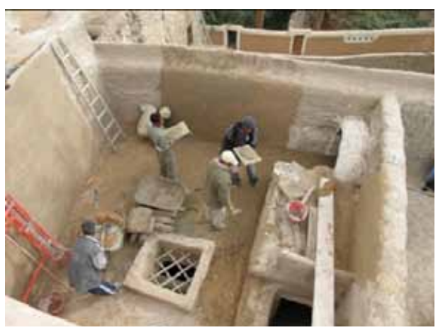
Figure 7: Brick production and restoration works organized in 2009.

some people actually worked on site, others mobilized all their energy in trying to convince and sensitize officials on the real values of the city. This was not sufficient to maintain the fabric but it helped to sensitize many individuals.