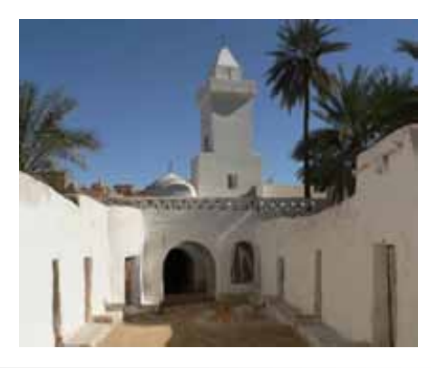
Figure 6: Some of the restored elements: the water reservoir, a street and the mosque. Left and centre: © Thierry Joffroy; right: © Sebastien Moriset