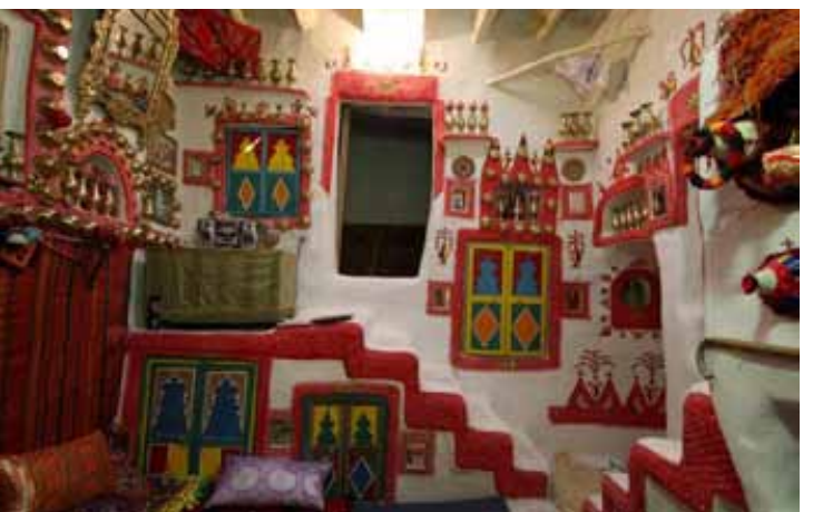
Figure 3: Examples of living rooms.