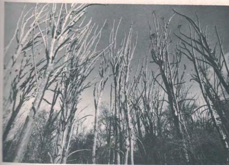
Figure 1 (b). The Didiereaceae bush occupied by the Sportive Lemur in the main study area (Berenty region; South Madagascar). The predominant plant representatives are the tall, taper-like Alluaudia procera and A. ascendens .

the Berenty region (S. Madagascar), constitute 65 per cent of the vegetation (Fig. 1b). These species resemble large, more-or-less ramifying tapers, about 12 m. in height, with a covering of fleshy leaves set at the bases of hard, sharp spines. Here and there, baobabs and some arborescent leguminous species project above the bush, which lacks a true canopy.