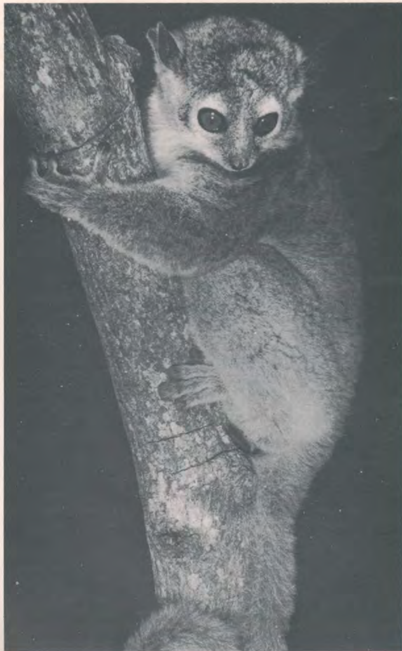
Figure 1 (a). The Sportive Lemur Lepilemur mustelinus leucopus (F. Major), photographed whilst active at night.