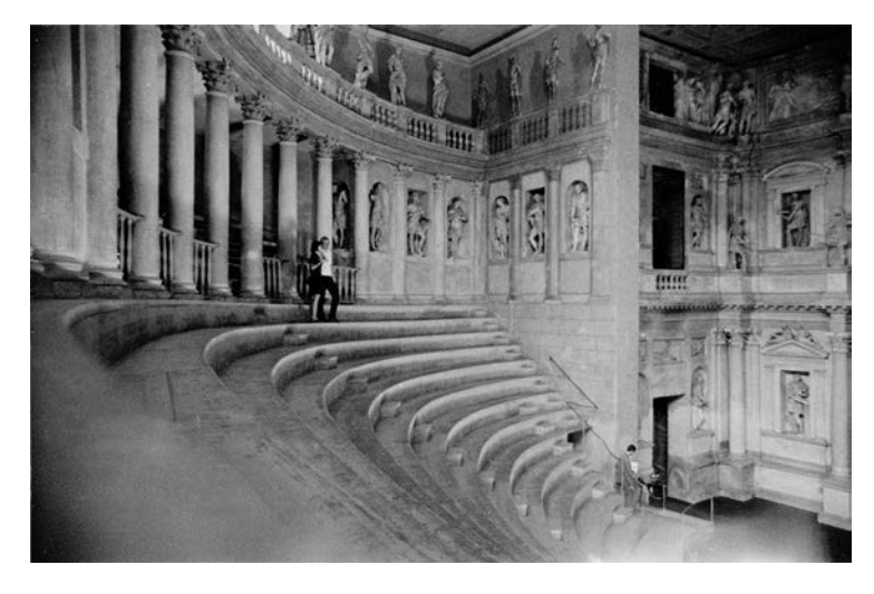
Figure 3. The Teatro Olimpico of Vicenza, built in 1585 in Italy.

At the same time when this transition from "presentational space" to "theatrical space" was occurring, a parallel transition occurred in which the "space for dissection" became what one might call the "place of anatomy." The anatomical amphitheatre was indeed a "theatre" in the sense that it was a place "where one sees," intended for an audience, and organized spatially and functionally with this purpose in mind. Moreover, it was a place where the event—that which one went to see — was something extraordinary, severed from the quotidian. The amphitheatres were theatrical spaces and the public anatomy lesson-Benedetti said it very well—was "theatrical material" defined by the presence of spectators. Spectators played a decisive role and it is thus natural that we should take an interest in them. Charles Estienne was preoccupied by them, as he knew full well the spectators determined the success of the anatomical demonstrations. and that "a public spectacle is never perfect unless everything belonging to the theatre is correctly arranged." One must, for example, guarantee visibility, because "that which is exhibited in the theatre appears much more excellent and natural when the spectators can all see equally well." Another crucial aspect