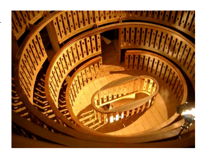
Figure 4. The anatomical theatre of Padua, built in 1595, remains standing today at the University of Padua, Italy.

was that each spectator should be able to leave independently without incommoding others, this being, according to Estienne, one of the major guiding principles with regard to "all of the things one proposes to the people" (Estienne 1545:347).