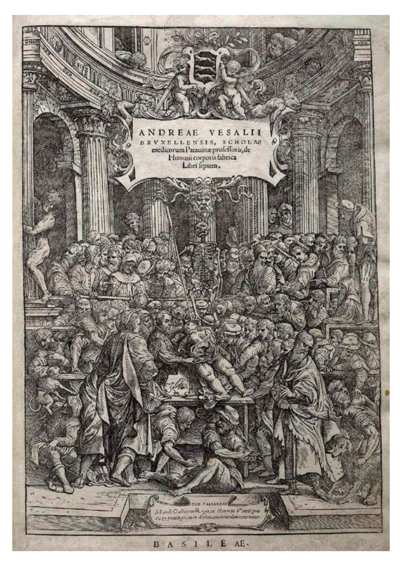
Figure 5. The frontispiece of Andreas Vesalius' De humani corporis fabrica shows a public dissection in an ideal amphitheater, rather than depicting an actual one. The engraver is unknown, probably the Flemish artist Jan Steven van Calcar (d. 1545–46). (In Vesalius 1543)

procedure gradually descended into the body's interior. In order to realize these operations, anatomists used a series of instruments, the principal ones being, of course, knives, razors, and other blades. In order to properly cut the segments, wrote André Du Laurens (1558–1609), one must have available the appropriate instruments, notably "razors of all kinds": large, small, mid-sized, straight and curved, oblong, pointy, of varying lengths, made of bronze, silver, lead, as well as wood and ivory (Du Laurens 1600:22). The anatomist, Estienne clarifies, must know how to use these instruments with the dexterity necessary to allow him to turn lightly and easily from the cutting to the blunt side, this last serving to "separate the skin," whereas the handle of the knives was used to divide the muscles and the membranes (Estienne 1545:344).