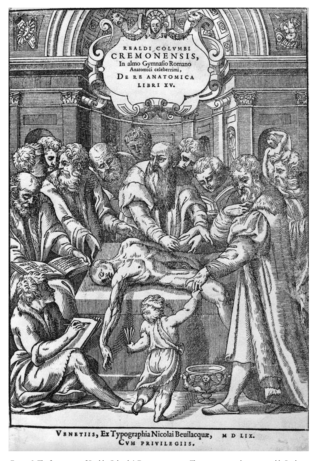
Figure 6. The frontispiece of Realdo Colombo's De re anatomica. The engraver is unknown, possibly Paolo Veronese (1528–1588). (In Colombo 1559)