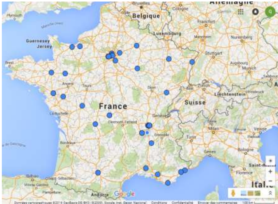
Q. Marron, E. Roux; Pacte, 2015. Data source: ENoLL, 2012

So living labs would seem to be spaces for open innovation, but mainly located – both in France and Europe – in an urban context. By extension, they potentially contribute to the development of these spaces, if we treat them as stakeholders in a knowledge economy or indeed a knowledge society (Innerarity, 2015; Talandier M., 2015).