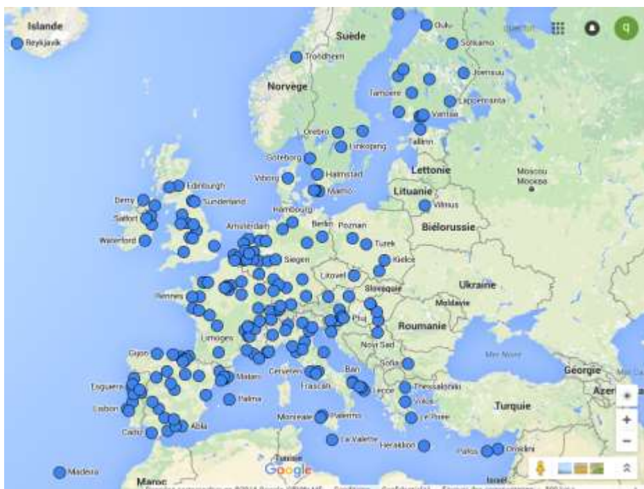
Figure 3. Geographical distribution of ENoLL-certified living labs in Europe and France

The most striking feature is that the higher the population the larger the number of living labs. Moreover, although there is a far from negligible number of living labs in towns with population of under 15,000, most are located in urban areas exceeding 100,000 people 4 . In Europe and France two-thirds of living labs are located in cities with a population of over 100,000 habitants; in Europe as a whole nearly half of them are cities with a population exceeding 200,000, compared with 40% in France (see Figure 3).