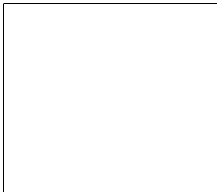
E. Draw your own picture or describe in your own words