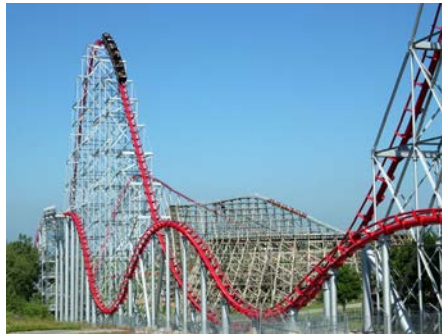
D. Roller coaster