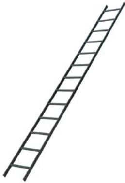
A. Vertical ladder

Which image best corresponds to your career?