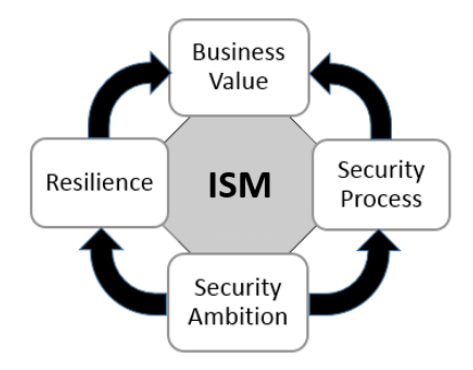
Fig. 1. Structure of the Information Security Management (ISM) assessment framework

The ISM assessment framework consists of four main dimensions that are illustrated in Figure 1. The first dimension was called Security Ambition (SA) and refers to the potential or future perspective of the BSC. The second dimension is called Security Process (SP) and is based on the internal process perspective of the BSC. The third Resilience (RE) perspective is based on the customer perspective of the BSC. Finally, the Business Value (BV) refers to the financial or value perspective of the BSC. These dimensions and their reasoning are described next.