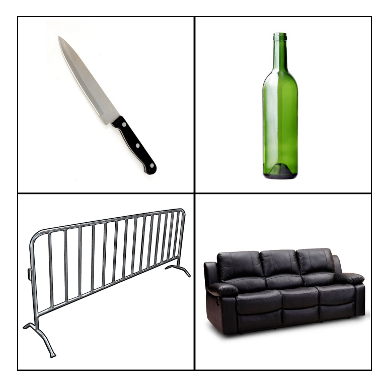
Fig 1. Examples of the kind of pictures used in Experiment 1. knife, bottle, fence and couch.