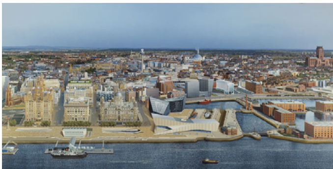
Figure 1. Liverpool Cityscape by Ben Johnson

While Ben Johnson's map was being inaugurated, another artist was wandering the streets of the city registering his experience in a map. Stephen Walter's Liverpool 2008-09 (fig. 2) is a