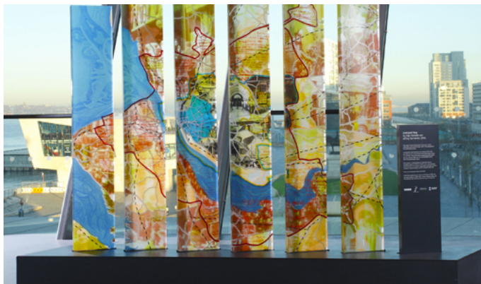
Figure 3. The Map of Liverpool by Inge Panneels and Jeffrey Sarmiento, as exhibited in the Museum of Liverpool

This too shall pass: Memories and noises from the Waterfront // 53°24'N 2°59'W - Liverpool. The City as an Affective Interface (fig. 4) is the full title of the media artist Brian Mackern's project developed during his residency at the University of Liverpool and FACT in October 2014. The artist recollected video footage from his derives in the city and then remixed sound and image in studio. The parameters for remixing are guided by a "socio economic historic curve" of Liverpool, which was built upon readings and conversations with the people from the city 4 .