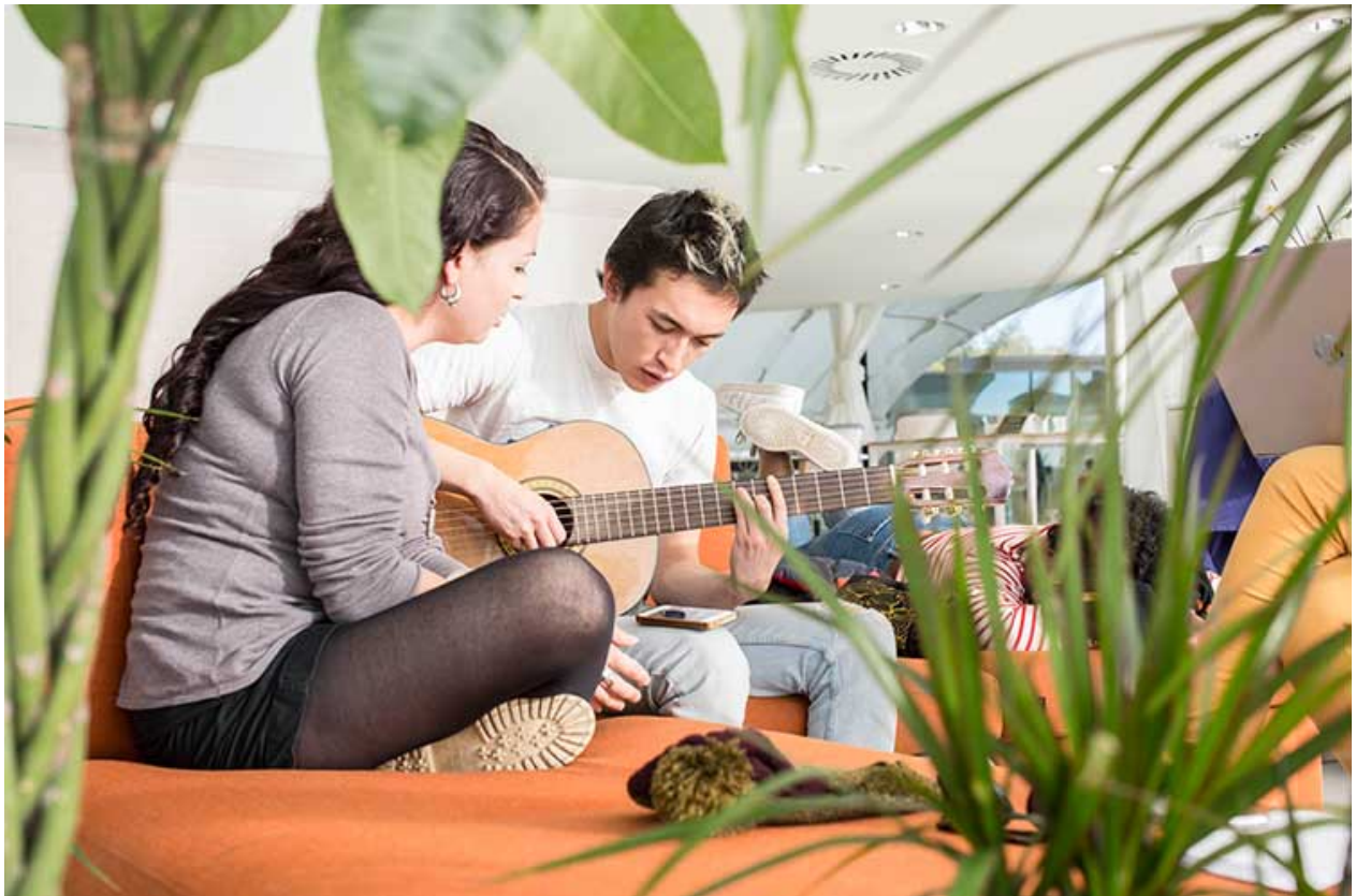
Here, at thecamp, the boundaries are definetely fuzzy...