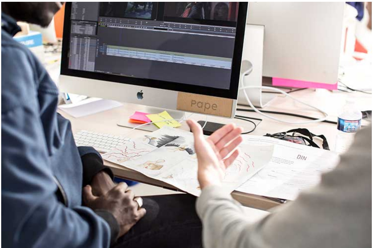
The exploration by the discussion and the collaboration.

Yet the Hive stands out from these models in one respect: a very long term collaborative and immersive research, in a unique public-private ecosystem. And by exploring new artistic and technical fields, particularly sensitive about digital and generative arts, openness towards connected objects, robotics, augmented reality technologies and in the methods of design thinking, design fiction or futuring design.