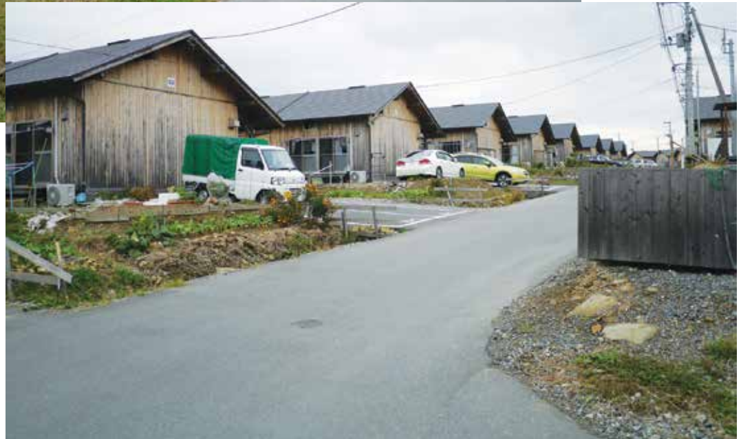
Temporary shelters for Naraha nuclear evacuees in Iwaki city (Fukushima).

their communities. The DEVAST field research found that they were often regarded as cowards or evaders who abandoned their communities and troublemakers who made Fukushima appear as an unsafe place to live among the general public, thus jeopardizing the collective effort to reconstruct Fukushima. Although this negative perception has somewhat improved over the last few years, the trauma from such a divide still remains within these communities.