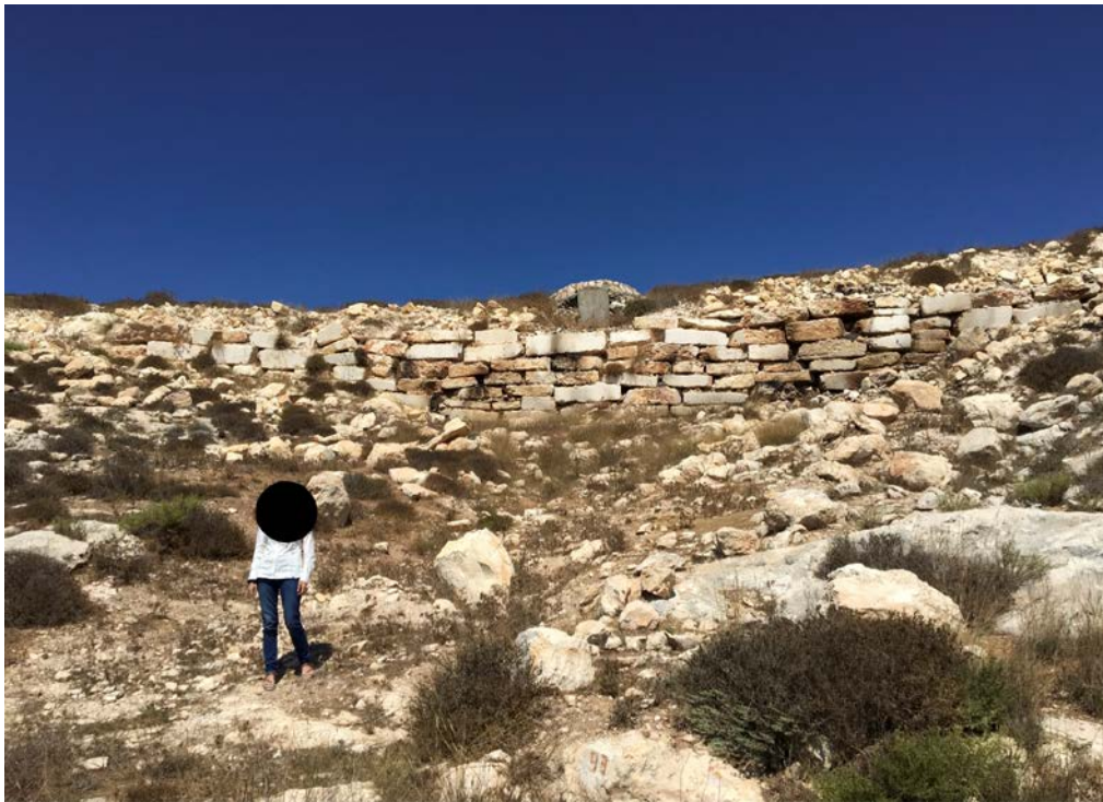
Figure 3: The southern wall bordering the terraces of a new agricultural pioneer front between Yasid and Beit Imrin. It corresponds to exploitation 2 represented in Figure 2.