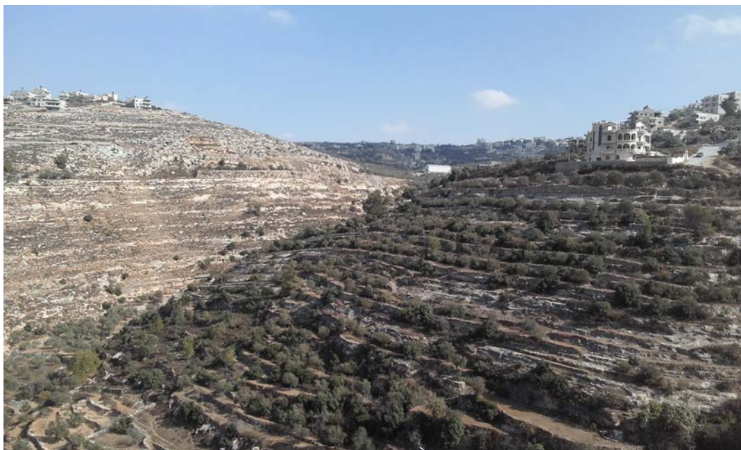
Figure 4: Traditional agricultural terraces in Battir village (next to Bethlehem), planted with olive trees.