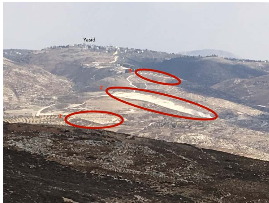
Figure 2: The interstitial pioneer fronts appearing in Figure 1.