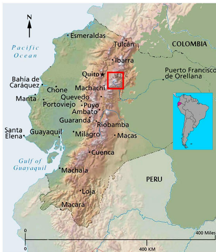
Figure 3. The box indicates the Sierra de Guamaní, the site of the Mullumica obsidian source.