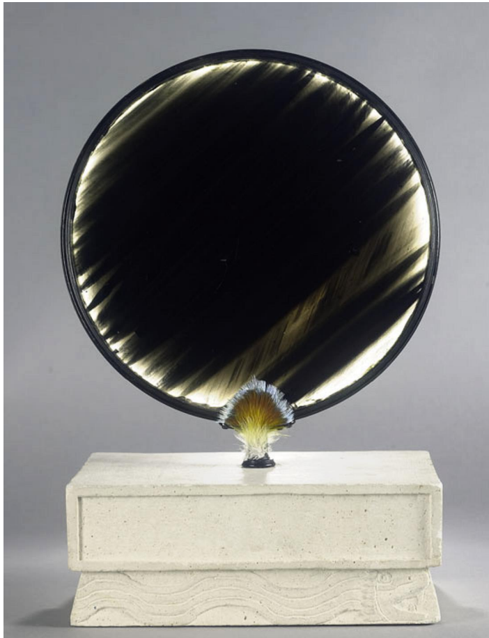
Figure 1. Obsidian “Inca mirror” No. 176.101 of the Muséum National d’Histoire Naturelle (Ø: 250 mm x 20 mm thickness). The plaster base and the feather decoration were added and made in a Mesoamerican style to conform to the supposed Mexican origin of the mirror.

by authors], with the number 22.U on the back of the label (Schubnel et al. 2001:31). Henri-Jean Schubnel, curator of the MNHN mineralogical collection, could not link this number to any reference in the museum catalogs and hence assigned to it the new reference 176.101.