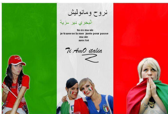
Figure 3: Facebook page “7ar9a”, posted on 10 December 2014

In one picture below, we see the colours of the Italian flag in the background. In the foreground is a collage of women supporters and three sentences written in different languages. In the Tunisian dialect, one can read, “I will leave and not come back. Sailor do a good deed,” referring directly to harga . In French, the phrase seems addressed to a loved one: “You are my life. I will cross the sea just to spend my life with you.” The last sentence, in Italian, is a message of love directed at a European country “I love you Italy”.