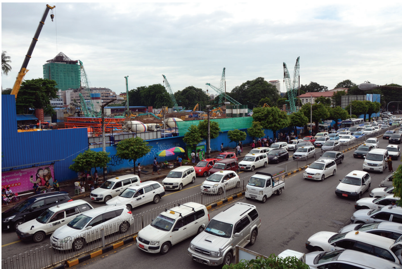
Fig. 3. Traffic congestion in Yangon city core, close to Bogyoke Aung San Market Photo: Marion Sabrié, 13/08/2014.