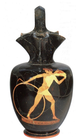
Figure 4. Attic red figure oinochoe (c. 460 BCE). Tampa Museum of Art, Joseph Veach Noble Collection 1986.073. After Neils/Oakley 2003, fig. 76 c.

The Latin clavis , “the key”, refers to a new sinuous or hook-like shape 17 , depicted on several images (fig. 3, 6, 7, 9a). Antyllus adds that the material of this new type of rod ( elatēr ) is made of iron, with a wooden handle.