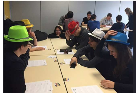
Figure 5. Jobs, activity sectors, localisations and joker to imagine a good to best job.

consequences (peer learning), take information and plan individual actions. Collaborative and active (cf. Figure 4), this workshop has two advantages: (i) to take the professional decision and (ii) to discover a solving problem method, in a same time. Each student wears one hat with a specific colour. The white hat gives the factual point of view, the yellow hat speaks about the benefits and advantages, the black hat speaks about the difficulties and risks, the green hat shows the opportunities, the red hat is feeling and emotional intelligence, the blue hat is the rational thinking. With this 360 degree vision, the professional project target could be approved or not.