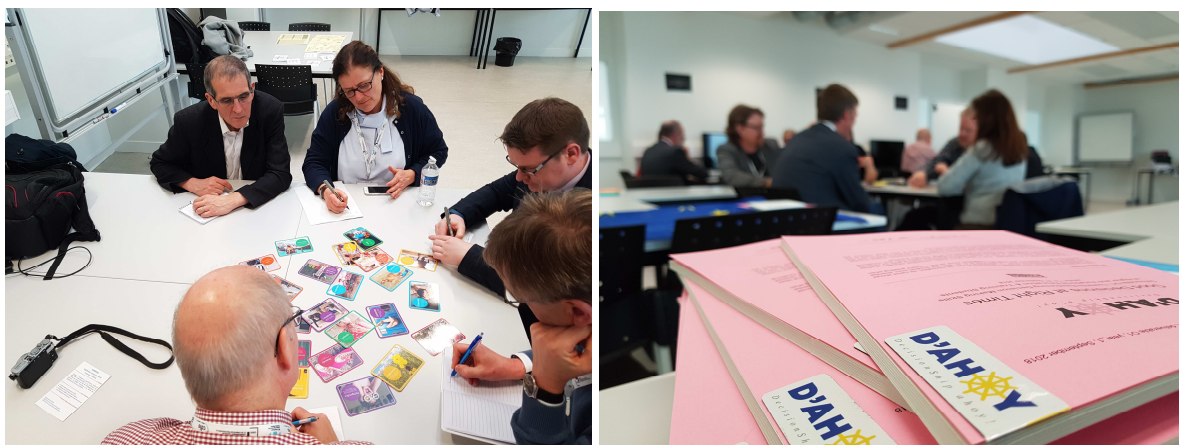
Figure 4. DAhoy Strengths character gamers during the CDIO European Conference, January 2019

Thanks to group session, Strengths cards can be used in many ways to facilitate individuals giving feedback to each other (cf. Figure 4), to reflect on project successes, to set goals or reflect on team identity.