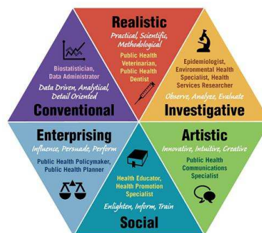
Figure 1. Holland types

Several models addressing career decision making and learning exist. The Holland Codes or the Holland Occupational Themes (RIASEC), is a theory of careers and vocational choice based upon personality types [8]. This theory is the best known and most widely researched. There are six basic types of work environment: Realistic, Investigative, Artistic, Social, Enterprising, and Conventional (cf. Fig. 1). People consider environments where they can use their skills, abilities and values. For example, Investigative types are more looking for a problem-solving environment. People who choose to work in an environment similar to their personality type are more likely to be satisfied. A hexagonal model (figure 1) shows the relationship between the personality types and environments. Choosing a career or education program that fits Holland personality should be a vital step toward career well-being and success–job satisfaction.