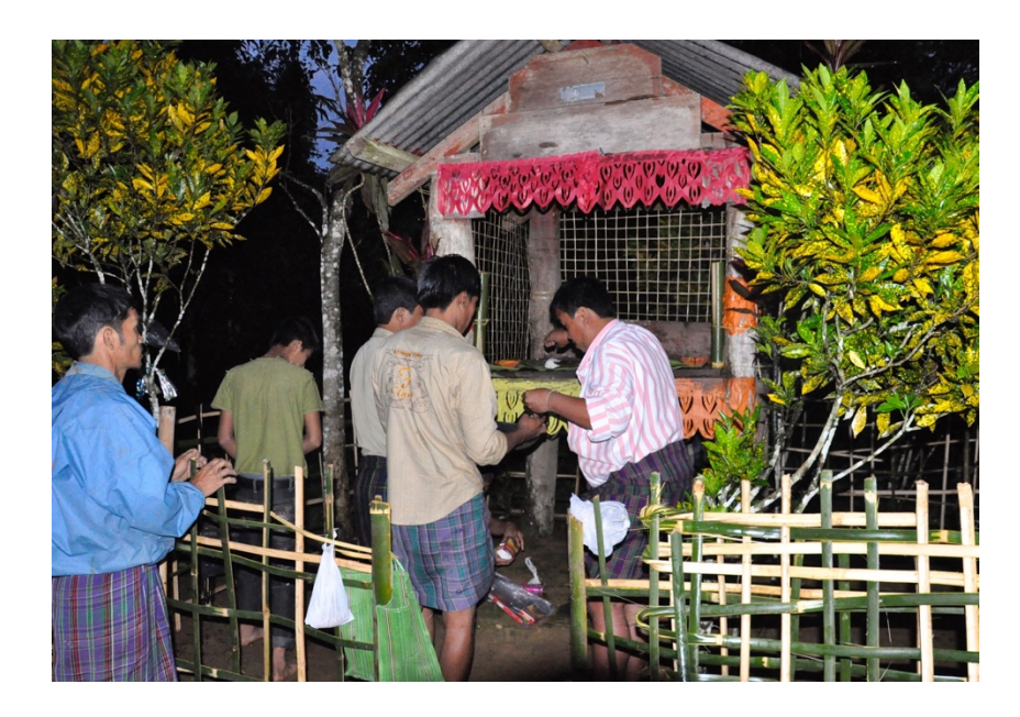
Photo 2- The village chief places the food on the altar of Choi Noi Cheynam.

territorial cults and ritual expressions in the Sino-Indian margins. Case studies helped highlight the diversity of these supernatural forces, and made direct references to and are " tied to soil, water, forest and game, these entities are the masters of nature's resources. " (Schlemmer 2012, 9). Furthermore, one of the main characteristics of the 'forces of the place' would be in the explicit reference to it within a defined territory, in which they exercise control over an entire set of beings, irrespective to their local and spatial properties (from villages to forest areas). A particularity of the force of the place would be in their capacity to legitimize the occupation of a specific zone by a population, ensuring its prosperity as well as its attachment to the soil, visà-vis of other local populations in the vicinity.