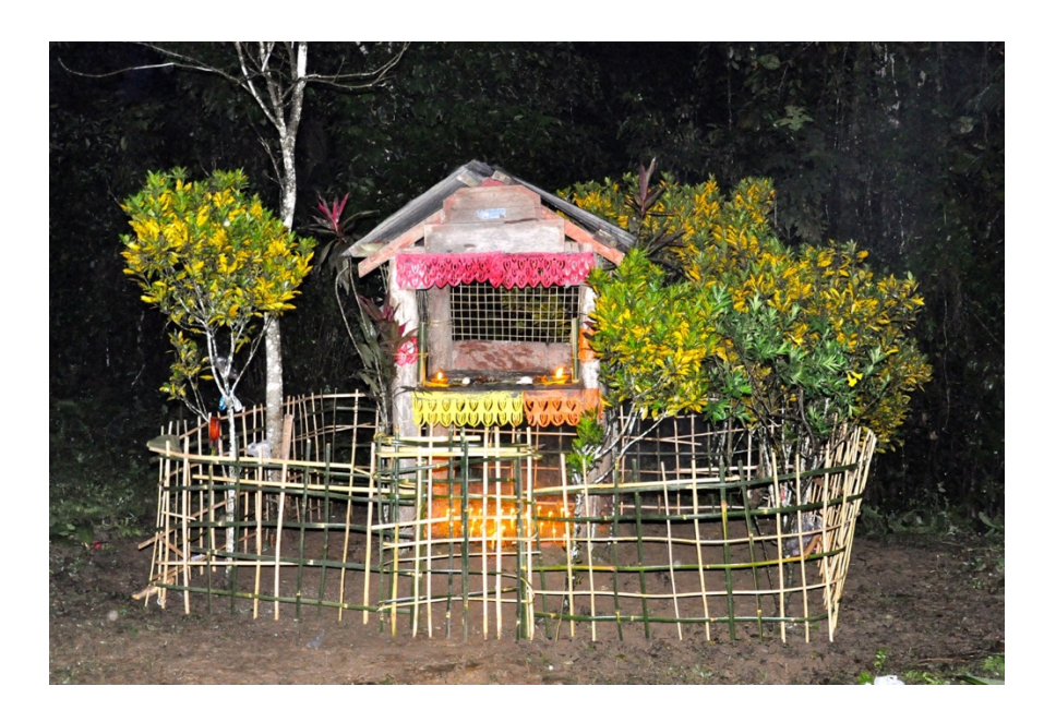
Photo 1- Altar devoted to Noi Cheynam during the annual ceremony

village chief, the whole community comes together to ask the Chao Noi Cheynam for protection and prosperity. Once the dishes were served to the deity, the villagers began to pray together, before the chief closes the fence to let the divinity consume the offering. As the rain started to get violent, everyone congregated at school to share in the collective meal.