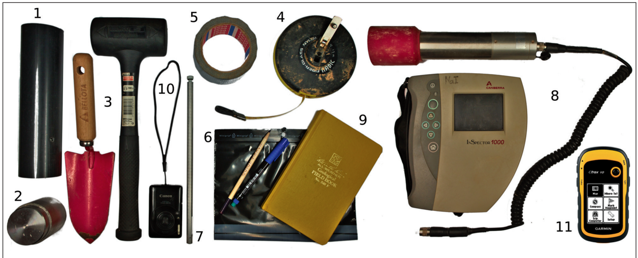
Fig. 1 : Example of field material necessary for ESR sampling

(1) PVC or metal tubes, (2) metal cap, (3) hammer and hand trowel, (4) measuring tape, (5) Duct tape (6) opaque ziplock bag, dark-colored permanent pen and pencil (7) dosimeter, (8) field-portable gamma spectrometer, (9) field notebook, (10) photo camera et (11) portable GPS.