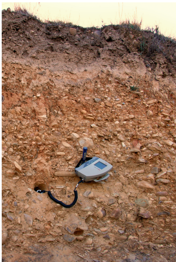
Fig. 3 : In situ \gamma spectrometry measurements accurately capture the \gamma dose rate.

The external dose rate ( D ) evaluation is based on the determination of \alpha , \beta , \gamma and cosmic components. \alpha and \beta dose rates should preferentially be obtained from the raw sediment collected at the sampling spot, while the gamma dose rate would ideally require an in situ measurement, although it may not always be possible. In this context, bulk sediment samples for D analyses and moisture content should be collected from the ESR sampling site (tube hole) or from a 30 cm radius sphere around the sample (fig. 2). Radioelement concentrations or activities may be derived from various techniques, such as total \beta counters (requiring a few grams of raw sediment), ICP-MS (~150 g) or High Resolution Gamma Spectrometry (approximately 100-150 g is sufficient). Samples should be bagged and clearly labelled using the same acronym to that ESR sample. In addition, the evaluation of the in situ gamma dose rate can be done using either a field portable gamma spectrometer (fig. 3) (Mercier & Falguères, 2007) or TL-OSL (Thermo and Optically Stimulated Luminescence) dosimeters. Dosimeters have to be inserted at least 30 cm deep into the section for between six months and a year. Consequently, the site should be accessible and secured to avoid any