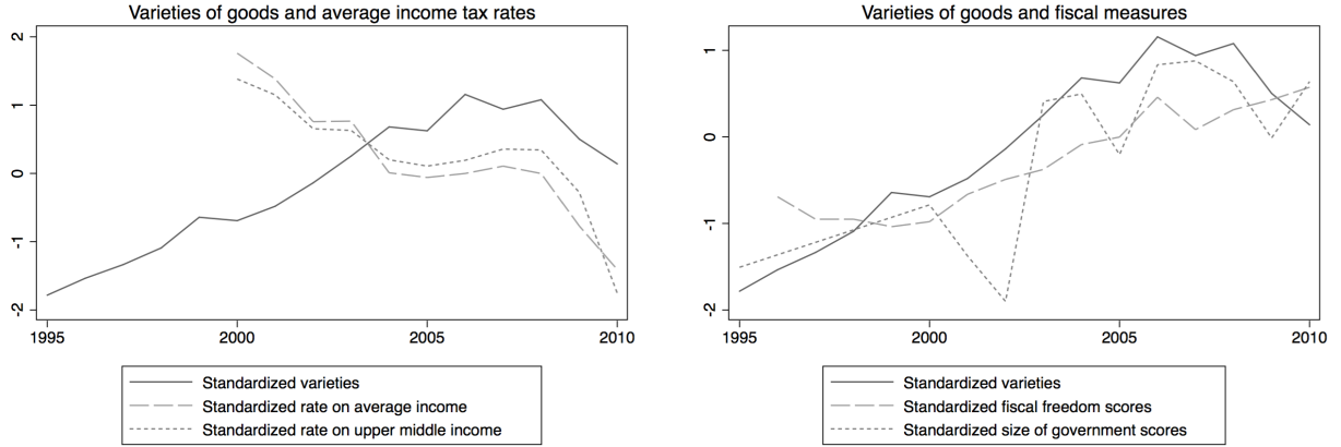
Figure 2: Within country standardized variation in the key variables for Denmark. The average income tax rates are in the left-hand panel and the fiscal freedom scores are in the right-hand side panel.

from the Heritage Foundation (Heritage Foundation, 2016), which is a sub-index of their index of Economic Freedom. It is an equally weighted index of the total tax revenue as a percentage of GDP, the top rate on individual income, and the top rate on corporate income. The index ranges between 0 and 100, where higher scores represent higher degrees of fiscal freedom. Apart from its clear relevance as a proxy for fiscal pressure, the Fiscal Freedom index starts from 1995, allowing us to extend the panel regression analysis over a slightly longer time period. Second, we use the index of the Size of Government from the Fraser Institute, which is a sub-index of their Economic Freedom of the World Index. The index is composed of general government consumption as a percentage of total consumption, government investment as a percentage of total investment, the top marginal tax rate and the income threshold for it, as well as transfers and subsidies as a percentage of GDP. The index ranges between 0 and 10, where higher scores correspond to a smaller governmental presence in the private economy. Figure 2 demonstrates how our measures of fiscal pressure co-vary over time with varieties of goods for Denmark. The figure presents the within-country standardized variation for the average tax rates in the left-hand side and for the fiscal scores of the Heritage Foundation and the Fraser Institute in the right-hand side.