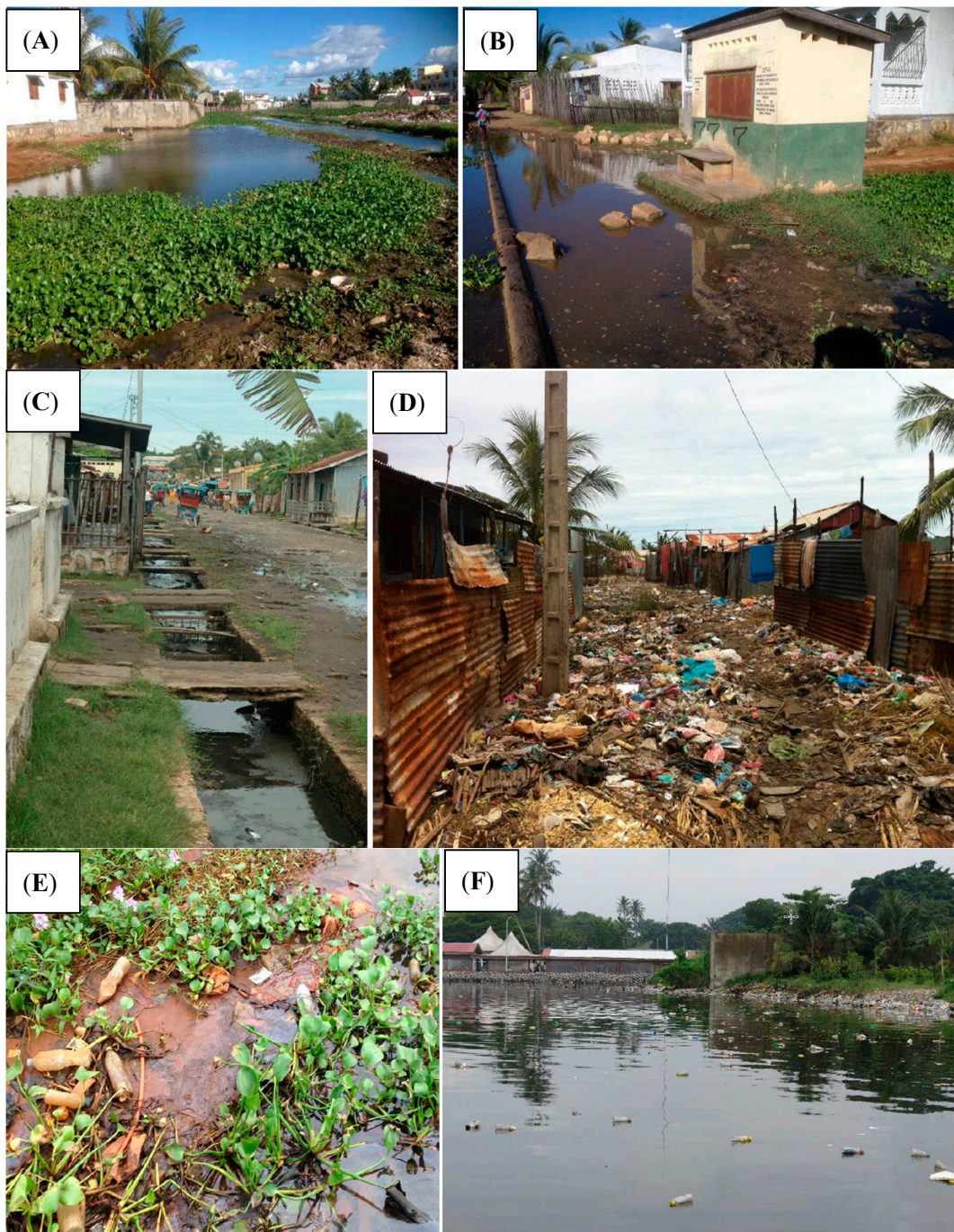
Figure 1. Plastics and garbage in an open sewer network; (A–D) Mahajanga, Madagascar, 2014, (A,B) open sewer network, (C) standpipe in a flooded area, (D) garbage pen in an area liable to flooding; (E,F) Ébrié Lagoon in Abidjan, floating plastics.