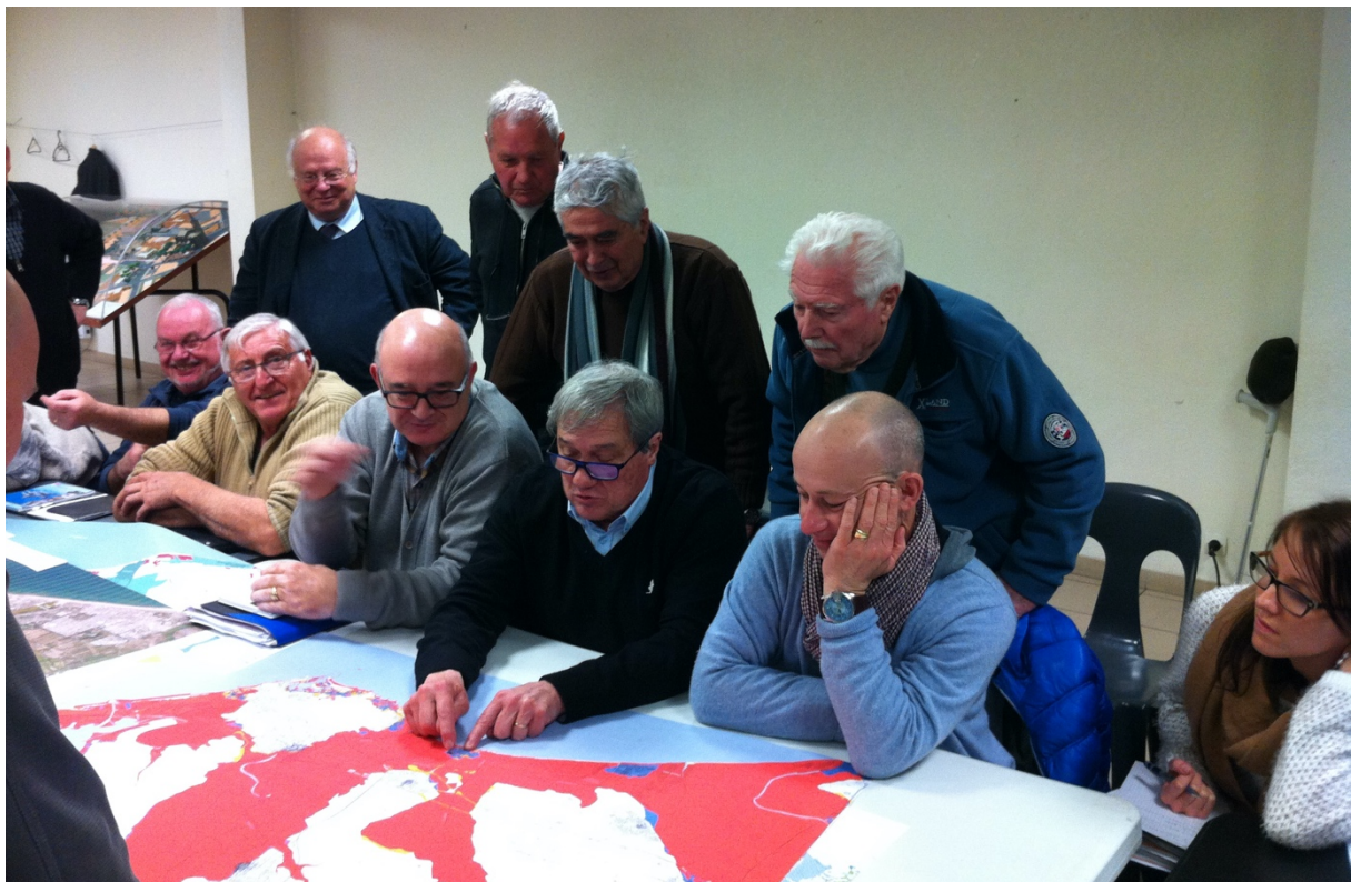
Figure 2. Photograph of a workshop during the co-construction process. The Flood Risk Assessment plan is discussed to find new adaptation strategies in spite of the restrictive regulation.

Even if the particular conditions of the re-composition were to be better defined, all actors involved, from associations to local governmental services, understood the opportunity of such an approach. But, beyond the desire of experimentation and sharing, the project had to face legal barriers, defining a new phase of uncertainty [figure 2].