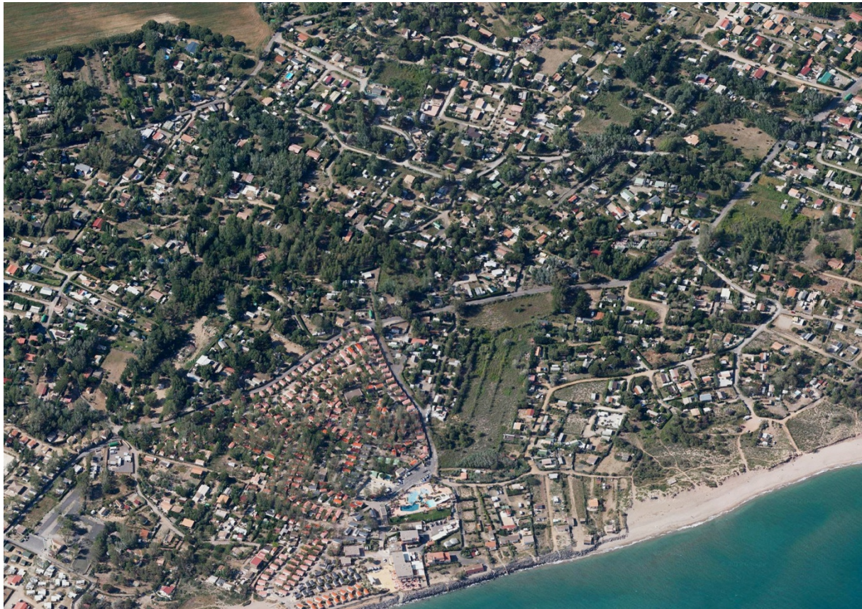
Figure 1. Aerial view of the West Coast of Vias. In this picture, the huge presence of huts is clearly visible.

In Vias, project conditions are characterized by a double uncertainty. On the one hand, the impact of global warming and sea level rise on natural hazards is difficult to assess. On the other hand, there is a lack of official data and a poor knowledge about habitat forms that aren't recognized by institutions. However, whether it is climate warming or informal housing, our society appears unwilling to accept uncertainty. A significant part of environmental sciences presents the lack of knowledge as a hindrance to global warming adaptation. This is illustrated by the accumulation of modelling studies of hazards, allowed by digital tools, which fuel an endless quest for precision and strengthens the legal dimension of urban planning. Moreover, throughout the 20th century, the development of the French territory established a clear frontier between natural spaces and urbanized spaces, between “empty” and “full”. This dichotomy leaves little chance for informal habitat, unpredictable by definition, to prosper.