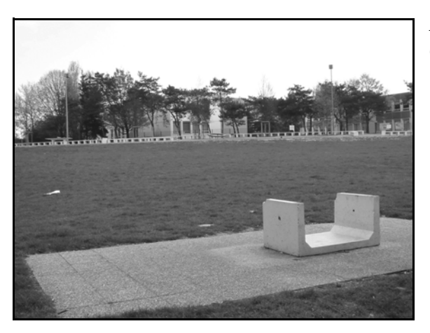
Picture 13 – A public space in the estate (Photo: Marcus Zepf, 3-4-2003)