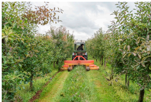
Figure 3. Management of inter-row perennial flower strips in an apple orchard by using a specific mulching device. The flower strip is about 0.5 m wide, whereas the adjacent vegetation is cut down frequently to reduce establishment of voles and competition for water and nutrients.

biopesticide [124] are expected to further promote natural pest control, because of the lower disturbance due to a reduced use of nonspecific insecticides. An increased uptake of such solutions by conventional farmers also is highly desired.