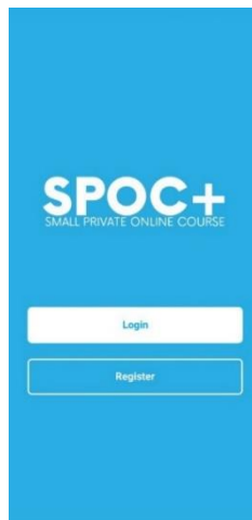
Figure 2. SPOC+ mobile interface

The website only used for the presentation of the application and our solution. The website made in PHP language with WordPress as the basic CMS. Collecting of colors and the design of our UI (User interface) were carefully considered. We chose blue for its soothing, calmness and relaxation (Singh, 2006) aspect (figure 2).