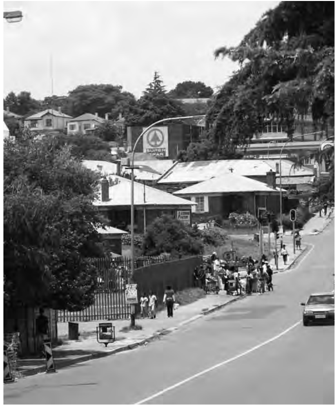
FIGURE 13.3: Bertrams Road, dividing Bertrams (on the left) from the Standard Bank Arena sports precinct (to the right of this image).