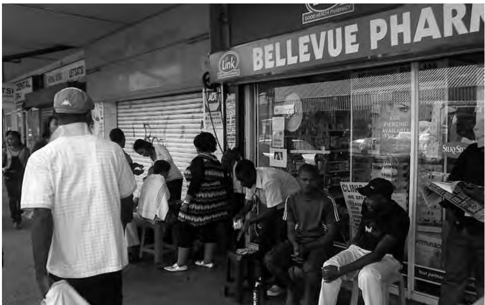
FIGURE 13.4: Rockey-Raleigh Street, the main commercial street in Yeoville.