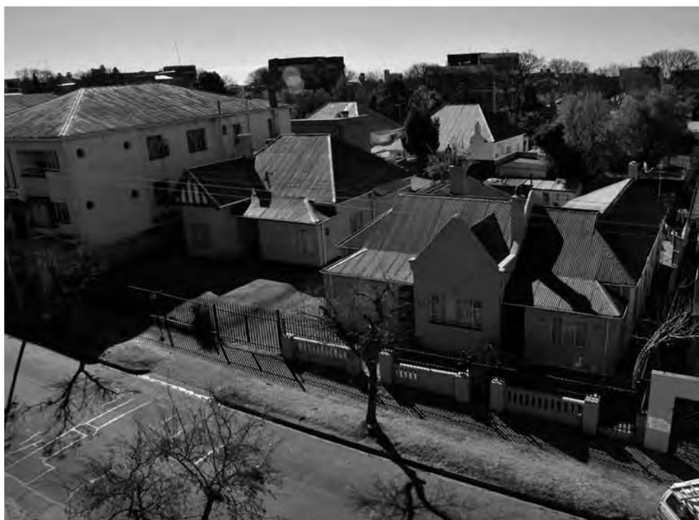
FIGURE 13.2: A typical Yeoville residential area showing a mixture of low-rise buildings and early twentieth-century houses.