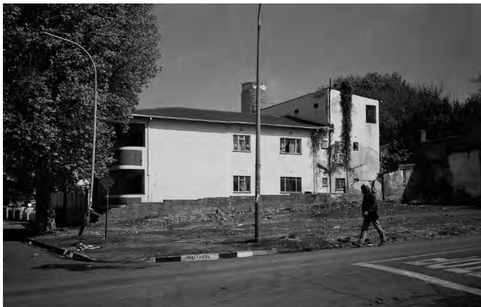
FIGURE 13.1: The urban fabric of Bertrams.