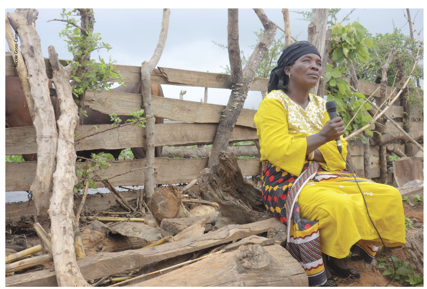
A Tanzanian villager shares local forest knowledge passed down from her mother and grandmother.

There are also practical consequences. First, efforts to bring about sustainability will only succeed—and will only themselves be sustained—if they are widely seen to be both fair and legitimate. We