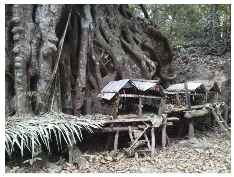
Dwellings and forest coalesce in a sacred location in northern Laos.

often see justice barriers to environmental policy where perceived unfairness leads to insufficient acceptance. For example, green taxes on fuel were met with intense resistance in France, partly because of very specific fairness concerns related to the disproportionate costs falling on rural, working-class people, and partly because of larger frustrations with a political system that was seen to disempower these groups. If we are to build a shared vision and constituency for transformative change, it must have justice at its heart. Second, if we fail to provide justice for marginalized groups, we will lose capacity to resolve the environmental crisis. For example, indigenous peoples make a huge contribution to protecting global biodiversity, yet this vital role is threatened by failure to recognize and appreciate their territories.6