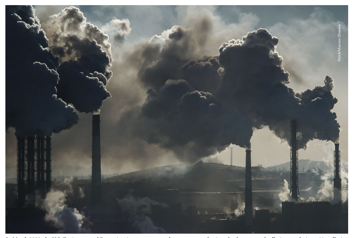
In March 2020, the U.S. Environmental Protection Agency announced temporary weakening of enforcement of pollution regulations. Air pollution disproportionately affects poorer communities, marking a central issue in environmental justice.

protected areas. Again, this is a sector that has incorporated commitment to social equity in recent decades, from the weaker "do no harm" to more progressive calls to be "pro-poor." 44,45 However, political ecology and justice scholars find that practices that exclude local populations persist.46,47 Rather than recognizing territorial claims and local institutions governing natural resources (i.e., attending to justice dimensions of recognition and procedure), trends toward more equitable conservation have mainly focused on distributional issues such as sharing of tourism revenues, compensation for wildlife damage, and alternative livelihoods. This narrow approach has led to claims that concepts like equity are being coopted to legitimize old regimes based on exclusionary models of conservation.<sup>48</sup> However, a growing body of evidence indicates that alternatives that embrace social justice more fully, such as provision of territorial rights of Indigenous peoples and local communities, and enabling