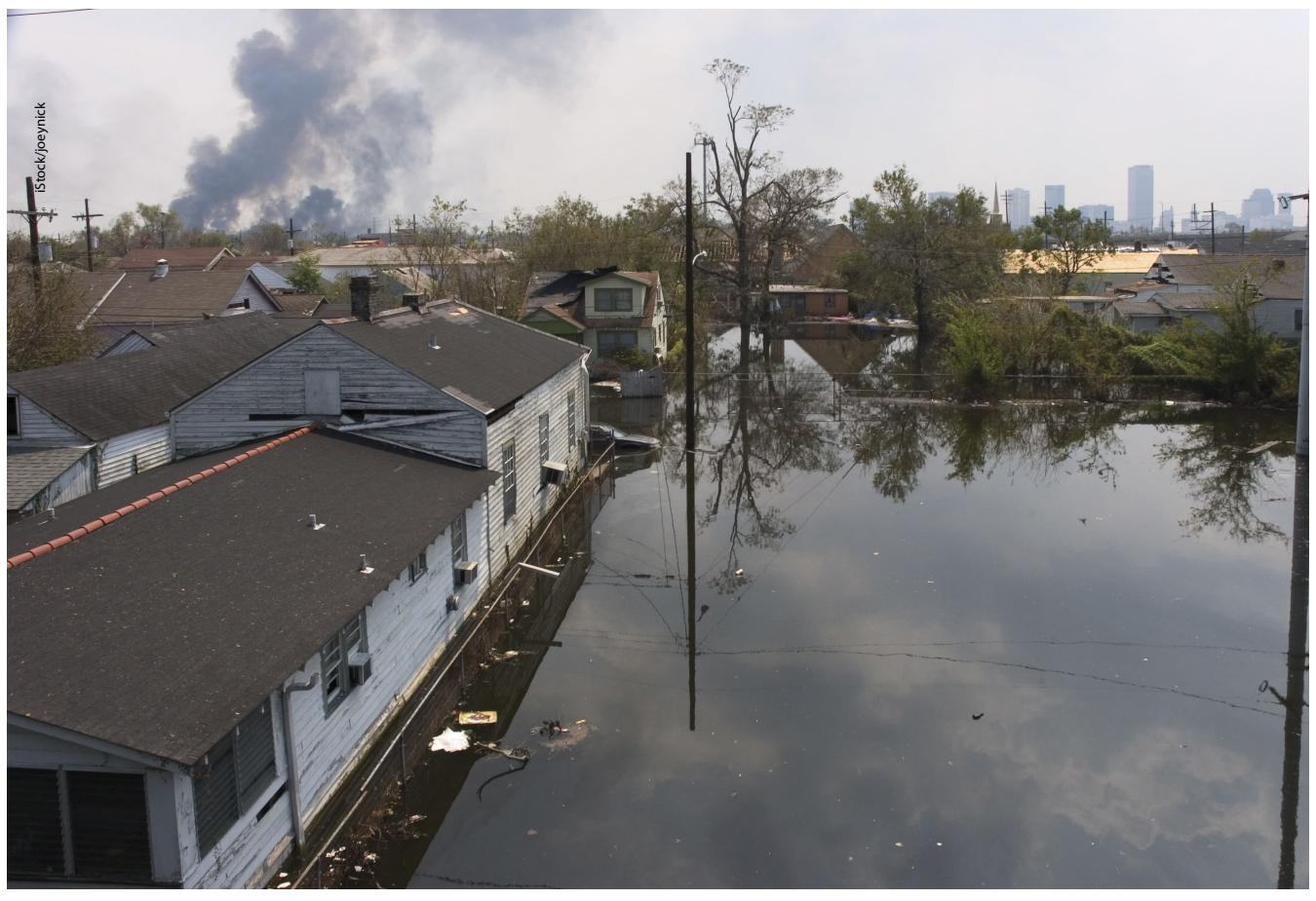
Some social groups are both more exposed to environmental hazards and more vulnerable to their impacts.

local stewardship, are the most effective, ethical, and cost-efficient way to conserve or restore habitats. 49,50