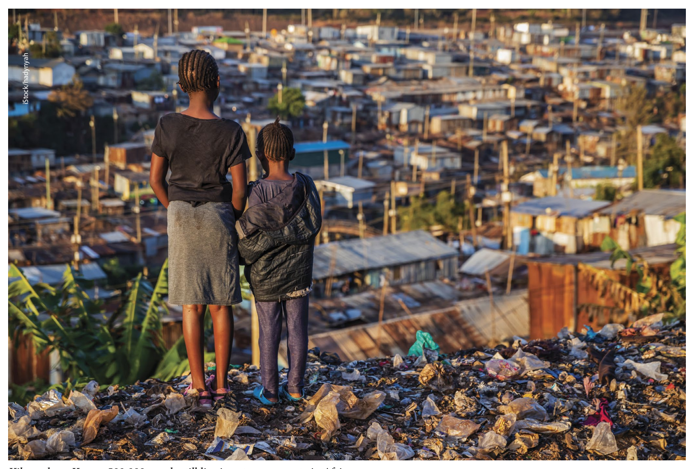
Kibera slum, Kenya: 500,000 people still live in extreme poverty in Africa.

will not enable long-term, sustainable transformation.