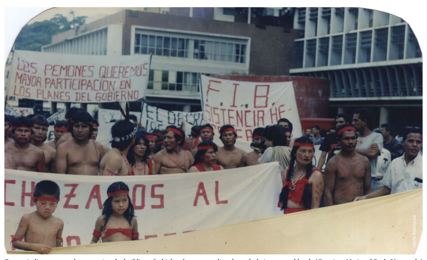
Pemon indigenous peoples protesting the building of a high voltage power line through their ancestral lands (Canaima National Park, Venezuela) in June 1997.

historically, in order to find clues about how it can be governed in the future.12 One important school of thought holds that we should focus our attention on trying to understand the conditions under which small-scale and local innovations become the seeds that grow into more profound societal change.<sup>13</sup> This is commonly known as the multilevel perspective: Local-level innovations such as alternative food networks gain momentum to a point where they start to disrupt and transform middle-level sectoral regimes such as the agribusiness-led food system. At the same time, momentum is facilitated by change to slower moving societal-level (or landscape-level) variables including cultural and political values: "In a nutshell the core logic is that niche-innovations build up internal momentum ...; changes at the landscape level create pressure on the regime; and destabilisation of the regime creates windows of opportunity for the diffusion of niche-innovations."14 For example, the emergence of wind turbines as a