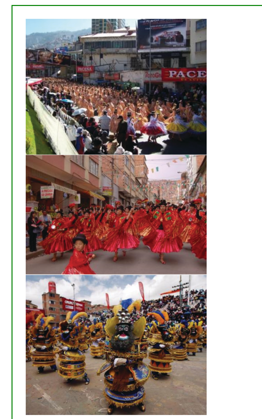
Figure 3 Parades and carnivals feature the different colors of the fraternities of the cholos elites

To return to the use of public space in El Alto, the most visible expression of corporations among local elites are parades and carnivals (see Figure 3) that take place regularly on the streets of the city (Harris, 1995; Guss, 2008; Hempele, 2008). Each group that participates in a parade is financed by a pasante (sponsor), who belongs to a fraternity whose colors feature in the participants' costumes (Albó and Preiswerk, 1991). Chalets constitute another manifestation of this affirmation of collective corporate identity in the city. Through the buildings and their material and symbolic—or economic and aesthetic—dimensions, the elites of the ethnic economy located in El Alto compete for the use of public space with local economic rivals. They compete in the streets by funding the most magnificent parade and producing the most visible—and original— chalet .