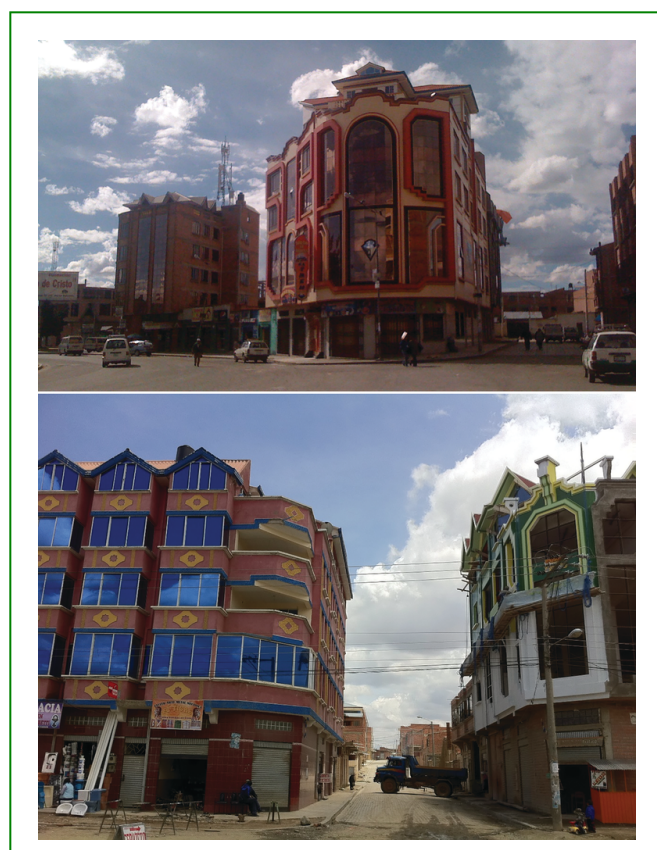
Figure 1 Two chalets in El Alto, with shops and workshops at the lower levels (photos by the author, 2010)

This essay analyzes the chalets as architectural forms embedded within an economy of symbolic goods characterized by a 'dual truth' (Bourdieu, [1997] 2000]): they are at once material and symbolic, performing an economic function while at the same time seeking conspicuous exposure and public visibility. The point here is to not explain this kind of Andean house as a 'cosmos' (Arnold, 1995) by showing how its internal organization reflects a specific vision of natural and social order, based on Bourdieu's early classic study of 'The Kabyle house, or the world reversed' from a structuralist perspective (Bourdieu, [1970] 1990). On the contrary, I emphasize the 'external' or public dimension of this novel architectural design (visibility aspects and aesthetic ornamentations). The chalets represent an obvious demonstration of social and economic power, and their prominent location on the streets and at major crossroads signals the eminence of a specific El Alto social group: a group of successful indigenous entrepreneurs in commerce, transportation or the textile industry—sectors that still account for an important part of the Bolivian economy (35% in the 2000s). The owners of these outlandish houses run family businesses that are deeply enmeshed in the international economy via imports from Brazil, Chile, Peru, the United States or China.