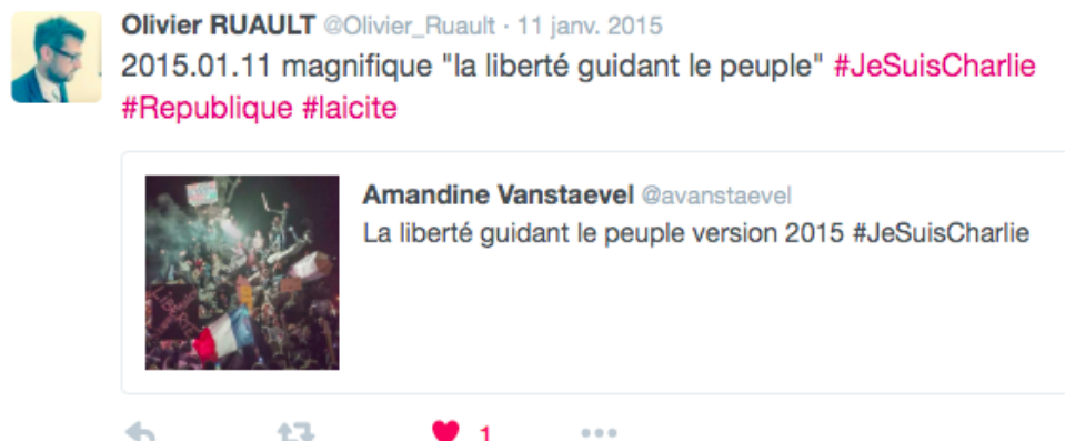
Image 5 - Multimodal tweet created by tweet quotation

tweet, retweeting or creating a new tweet and mentioning the sign “RT” (retweet), often accompanied with the sign “via”, thus quoting a tweet that then appears in a specific insert.