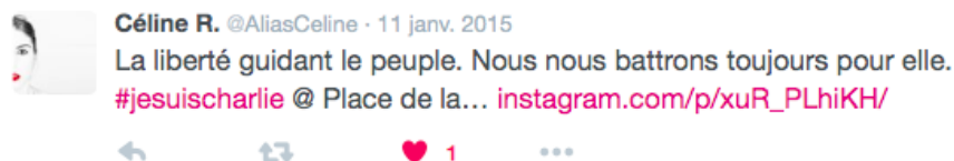
Image 4 - Multimodal tweet containing a URL link referring to a photograph on Instagram

Instagram gives its users the possibility to automatically publish content on another network. However, on Twitter only a link to Instagram will appear, and not the visual content. The automation of a publication could also lead to a shortened tweet – as in the following example –, which is not really ideal as far as the clarity of information is concerned.