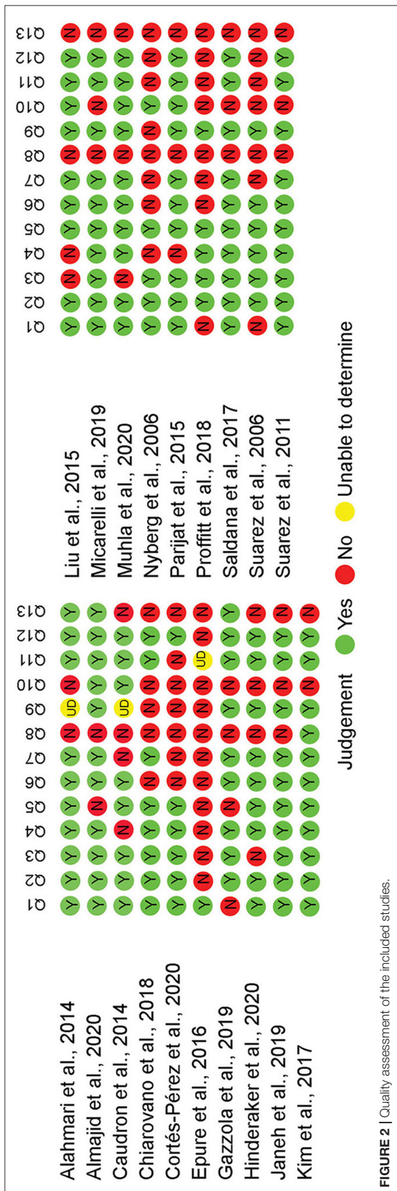
FIGURE 2 | Quality assessment of the included studies.