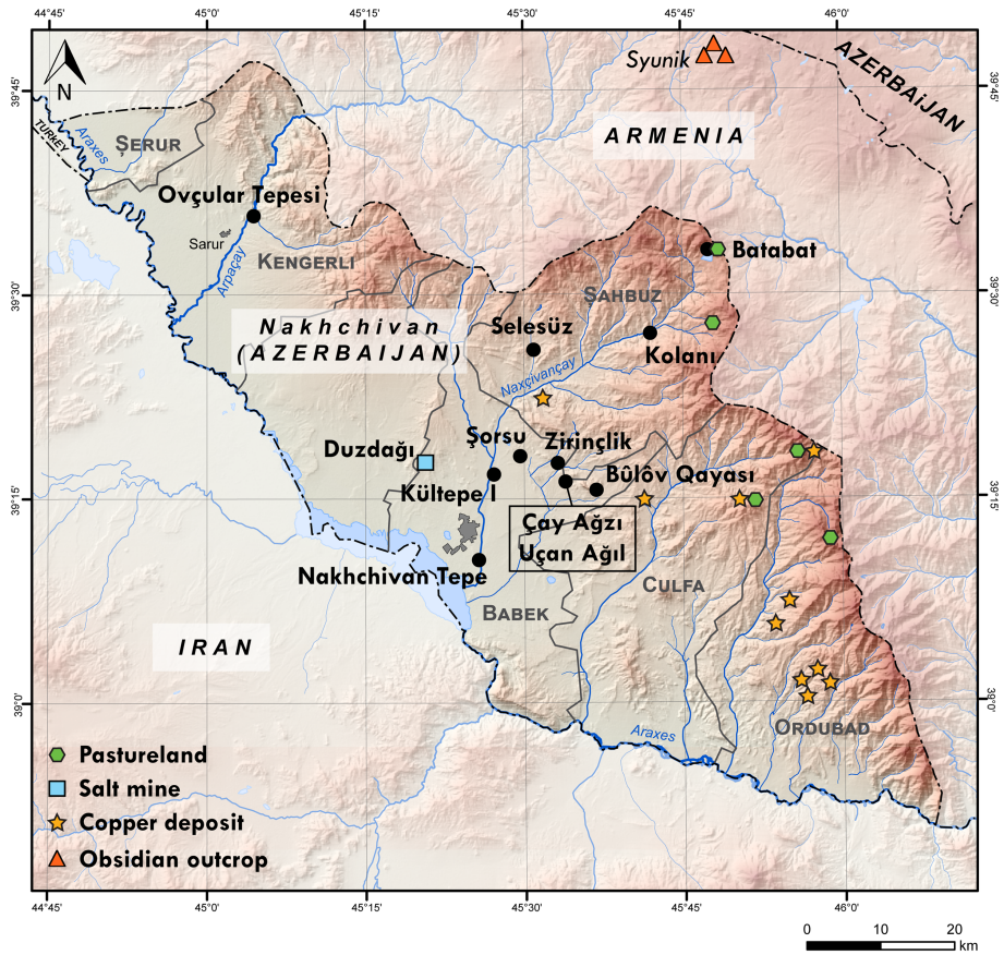
Figure 2 Detailed map of the main sites investigated in Nakhchivan in the framework of the PAST-OBS and SCOPE projects. [Correction added on 18 April 2021, after first online publication: Credits for Figure 2 have been included in the figure caption.]. [Colour figure can be viewed at wileyonlinelibrary.com ]

which lie close to important obsidian beds, such as those of the Zengezor mountain range (Syunik outcrops). All these characteristics suggest that these sites may have been intermediary camps used during the seasonal migrations between the plateaux of north-western Iran and the upper pastures of the southern Caucasus. As such, they may have been part of a broader economic system relying on the movement of mobile pastoralists, which stretched over the two regions.