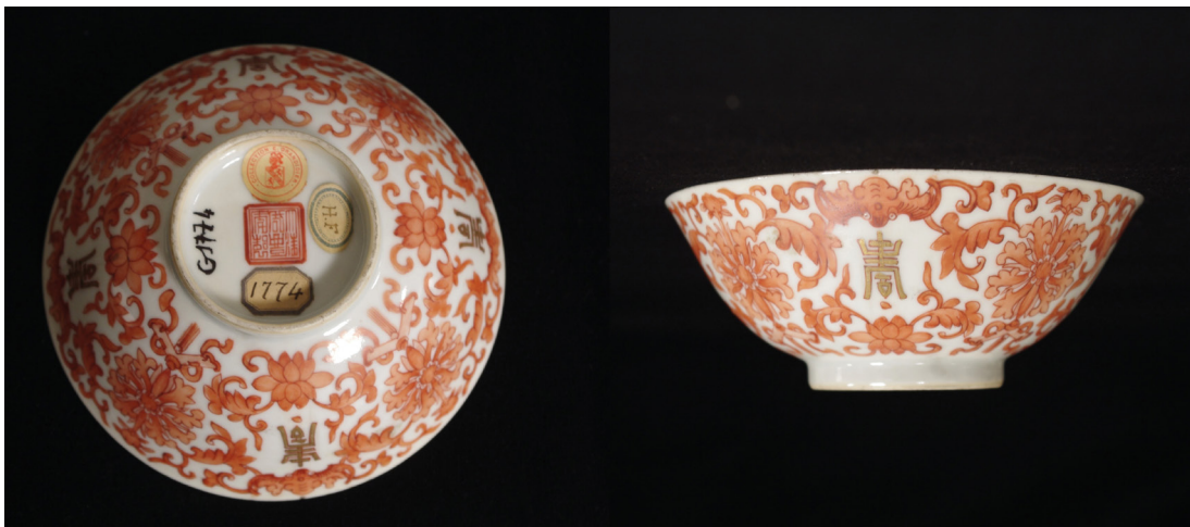
Fig. 4: Bowl, China, kilns of Jingdezhen (Jiangxi) Qing dynasty, Xianfeng period (1851-1861), porcelain, 5,5 x 12,6 cm, mark “Da Qing Xianfeng nian zhi” Paris, musée des Arts asiatiques – Guimet, inv. G1774