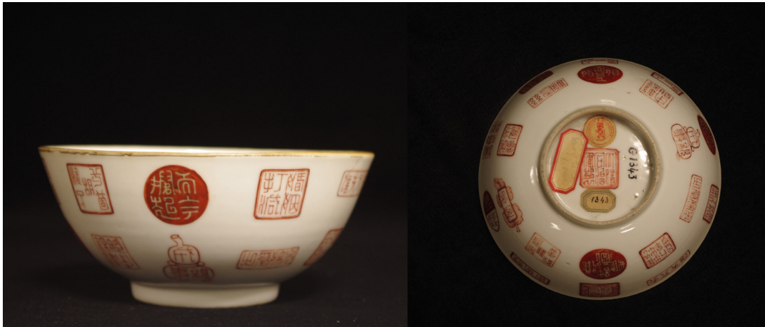
Fig. 7: Bowl, China, kilns of Jingdezhen (Jiangxi), Qing dynasty, Tongzhi period (1861-1875), porcelain, 6 x 13,5 cm, mark “Da Qing Tongzhi nian zhi”