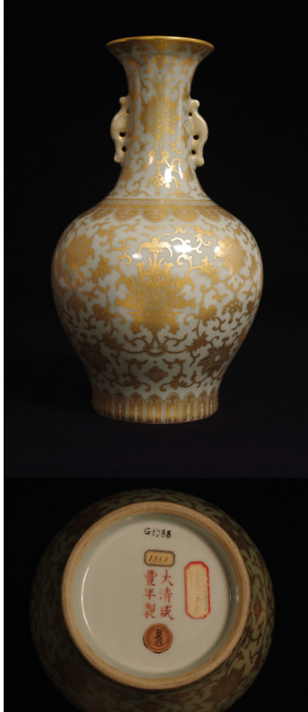
Fig. 5: Vase, China, kilns of Jingdezhen (Jiangxi), Qing dynasty, Xianfeng period (1851-1861), porcelain, 31 x 18 cm, mark “Da Qing Xianfeng nian zhi”