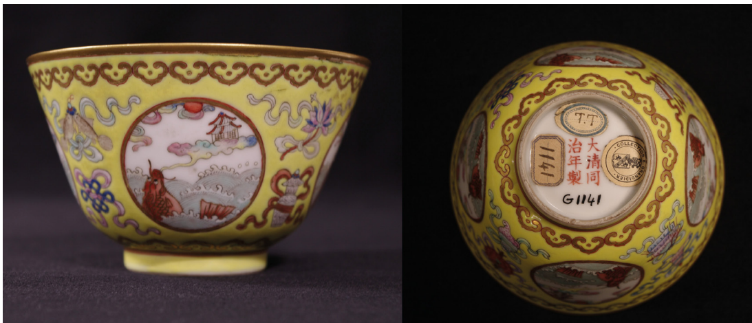
Fig. 6: Bowl, China, kilns of Jingdezhen (Jiangxi), Qing dynasty, Tongzhi period (1862-1874), porcelain, 6,5 x 10,5, mark “Da Qing Tongzhi nian zhi” Paris, musée des Arts asiatiques – Guimet, inv. G1141