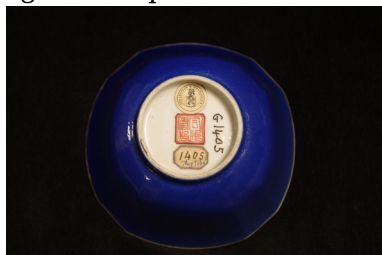
Fig. 8: Bowl, China, kilns of Jingdezhen (Jiangxi). Qing dynasty, Tongzhi period (1861-1875), 6,5 x 12,5 cm, mark “Tongzhi nian zhi”. Paris, musée des Arts asiatiques - Guimet, inv. G1405

number of such cases raises questions about the role of dealers as intermediaries, in the light of the previous considerations about their relationship with the collector. Mer-