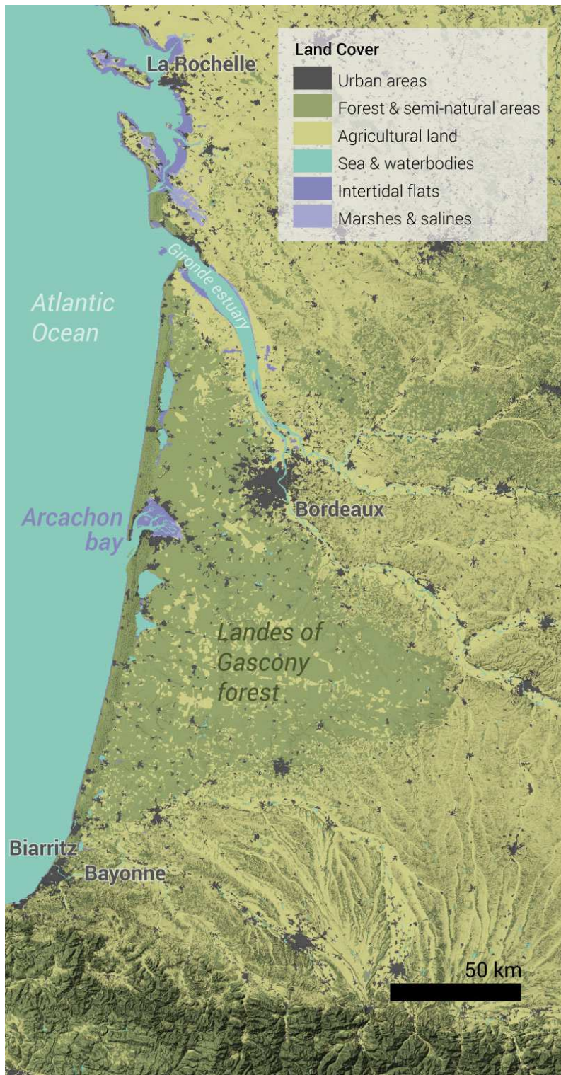
Figure 1 - Situation map of Arcachon Bay (B. Hautdidier. Sources: Copernicus (Corine Land Cover 2018), IGN (BD alti).