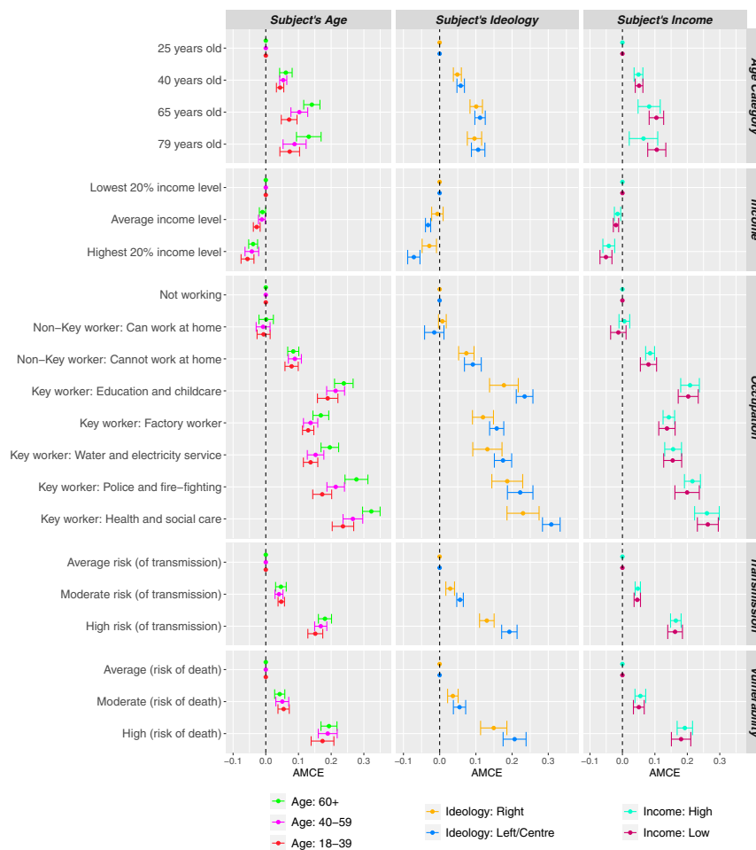
Fig. 3. Vaccine candidate decisions by age, income, and left-right self-identification. AMCE estimates are reported for attribute values (observations are pooled across countries). The 95% CIs are shown for each point estimate, clustered by country. Observation weights are not used.

(Table 1), public preferences for prioritization appear to be largely consistent across countries and larger regions. Moreover, when we estimated the conjoint model for subgroups in the samples, we found that preferences were consistent across a range of respondent characteristics, such as age and income (Fig. 3).