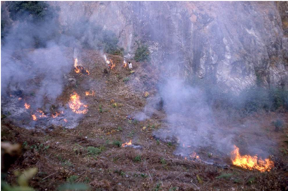
FIG. 2 – Slash and burn