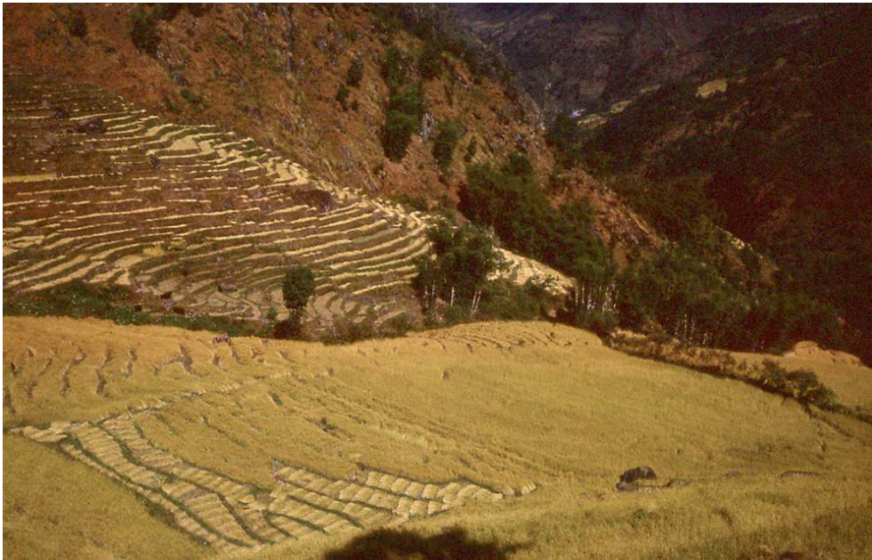
FIG. 1 – Terraced fields, harvests