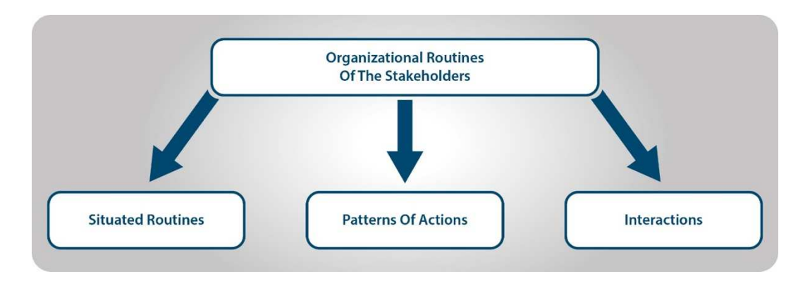
Fig. 2. Content of Organizational Routines

As a result, Hypothesis 2 (H2) is as follows: the controversy is defined as the confrontation of stakeholders' organizational routines.