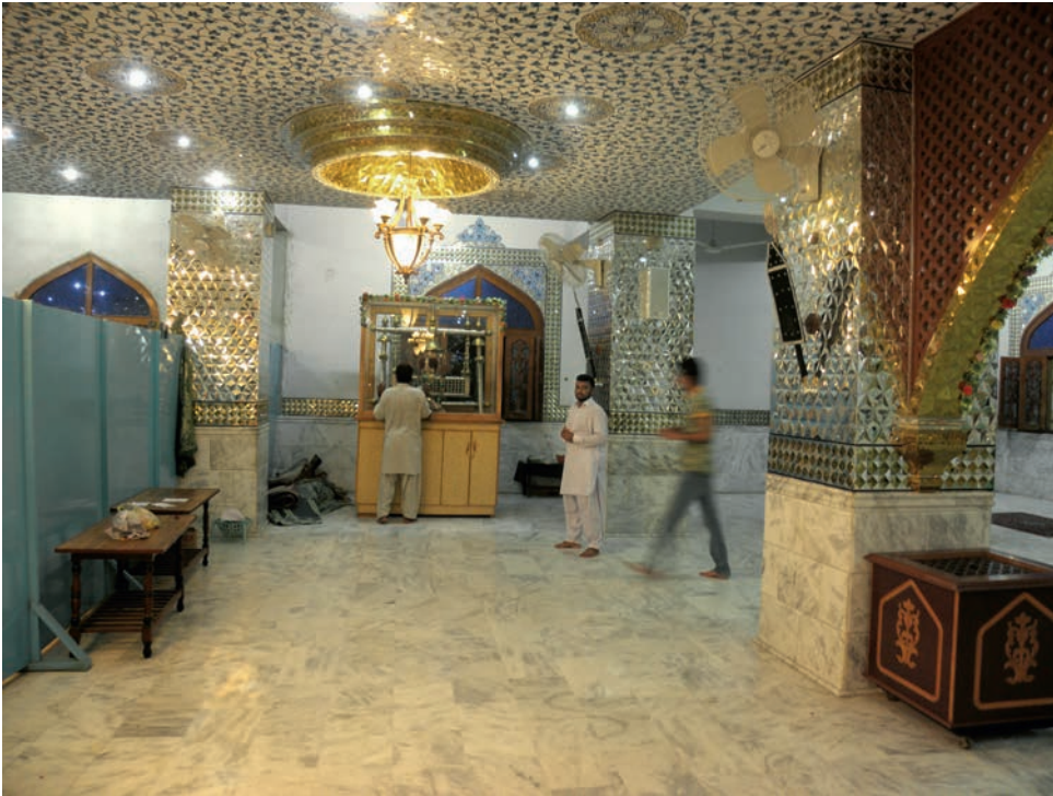
FIGURE 5 The main room, where many different devices related to the Imams are exhibited, Qadamgāh Imām ʿAlī, Hyderabad. On the left side, the palisade which separates men from women