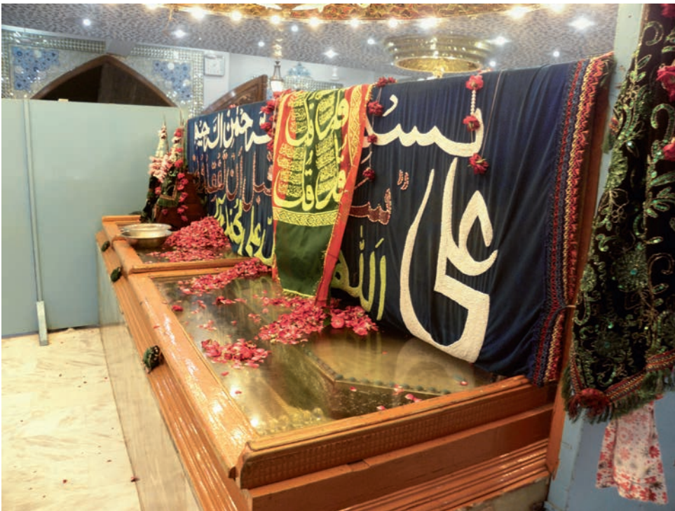
FIGURE 6 The footprints of ʿAlī in stone in Qadamgāh Imām ʿAlī, Hyderabad

the ritual varies and depends on the devotees. Once the vow is fulfilled, the devotees bring gifts or nazrānas to the Qadamgāh. They are of different types, and include sweets or flowers, but the best gift for spiritual benefits ( ṣawāb ) is an offering of niyāz , cooked food. 19