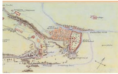
FIGURE 7.A Map of Hyderabad (Sindh) and neighborhood. January 1852 by Henry Francis Ainslie (c. 1805–79), British Library, Shelf mark: WD2080; Item number: 2080 The Qila is in red, and the Mowlā jā Qadam is not indicated.