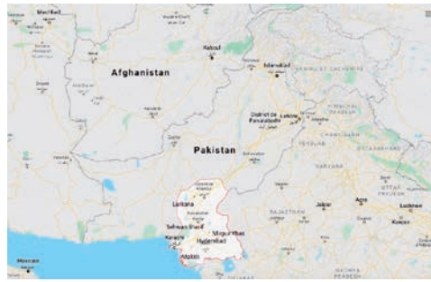
FIGURE 2 Sindh with main cities and places

“New Day” is an important festival among the Muslims of South Asia, for both Sunnis and Shi‘ites. In Persia, it was a celebration of the renewal of nature and the coming of Spring. In Qajar Persia (1779–1925), the shāh received guests consisting of kinsmen, military and civil officials, leading religious figures, tribal chiefs, poets, heads of various guilds, and, increasingly, foreign notables. The same protocol was possibly adopted by the Tālpūrs in Sindh. Furthermore, the transportation of the Mowlā jā Qadam to the Tālpūr capital can be given a strong political meaning. From early on in the history of the Muslim world, sacred relics were seen as a determining factor in the process of legitimizing a new political power (Meri, 2010).