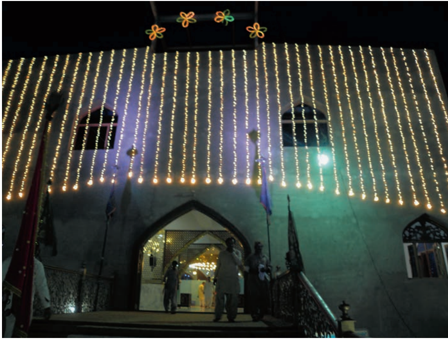
FIGURE 3 Exterior of Qadamgāh Imām ʿAlī, Hyderabad