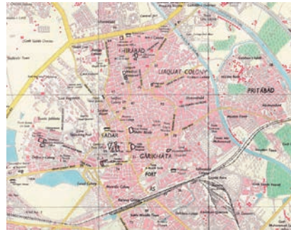
FIGURE 7.B Sketch Map of Hyderabad, Survey of Pakistan ↑North 2 cm = 500 m