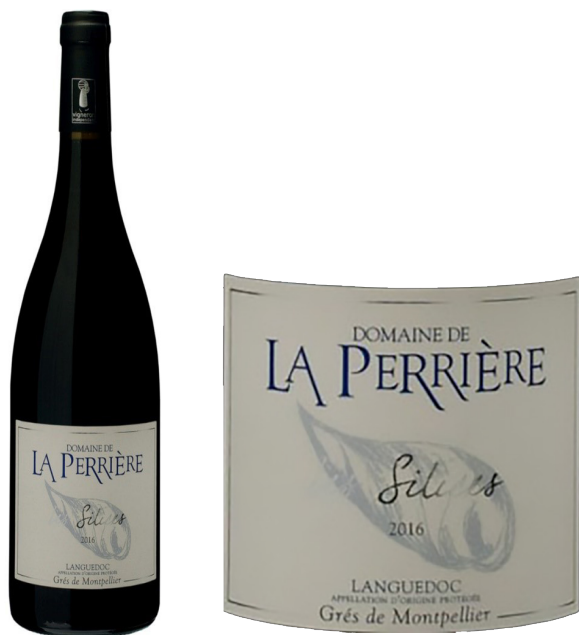
Figure 1. Example of a wine bottle exemplifying references to geology. Here, the estate name “domaine de la Perrière” is derived from a toponym indicating the past location of a quarry. In the appellation “Languedoc – Grès de Montpellier”, the word “grès” refers to the pebbly soils of the area, “Les Silices” to the mineralogy of the local pebbles, and the background illustration is fossil sketch.

(cuvées/vintage), and descriptive texts of the back labels (De Wever et al. , 2009). The diversity of references to geology can be illustrated with an example (Figure 1). In 2003, an appellation “AOC Languedoc – Grès de Montpellier” was erected for red wines produced on the hill slope facing the Mediterranean Sea around the city of Montpellier. The word “grès” does not refer here to sandstone (“grès” in French) but to an Occitan word for stones/pebbles. A local wine estate was named long ago after the local place name “Domaine de la Perrière”, probably in reference to the past location of a quarry. This estate sells a wine vintage “Les Silices” the label of which exhibits the sketch of a fossil in the background. The vineyards, from which “Les Silices” is derived, grow on siliceous pebble stones and fossiliferous limestones.