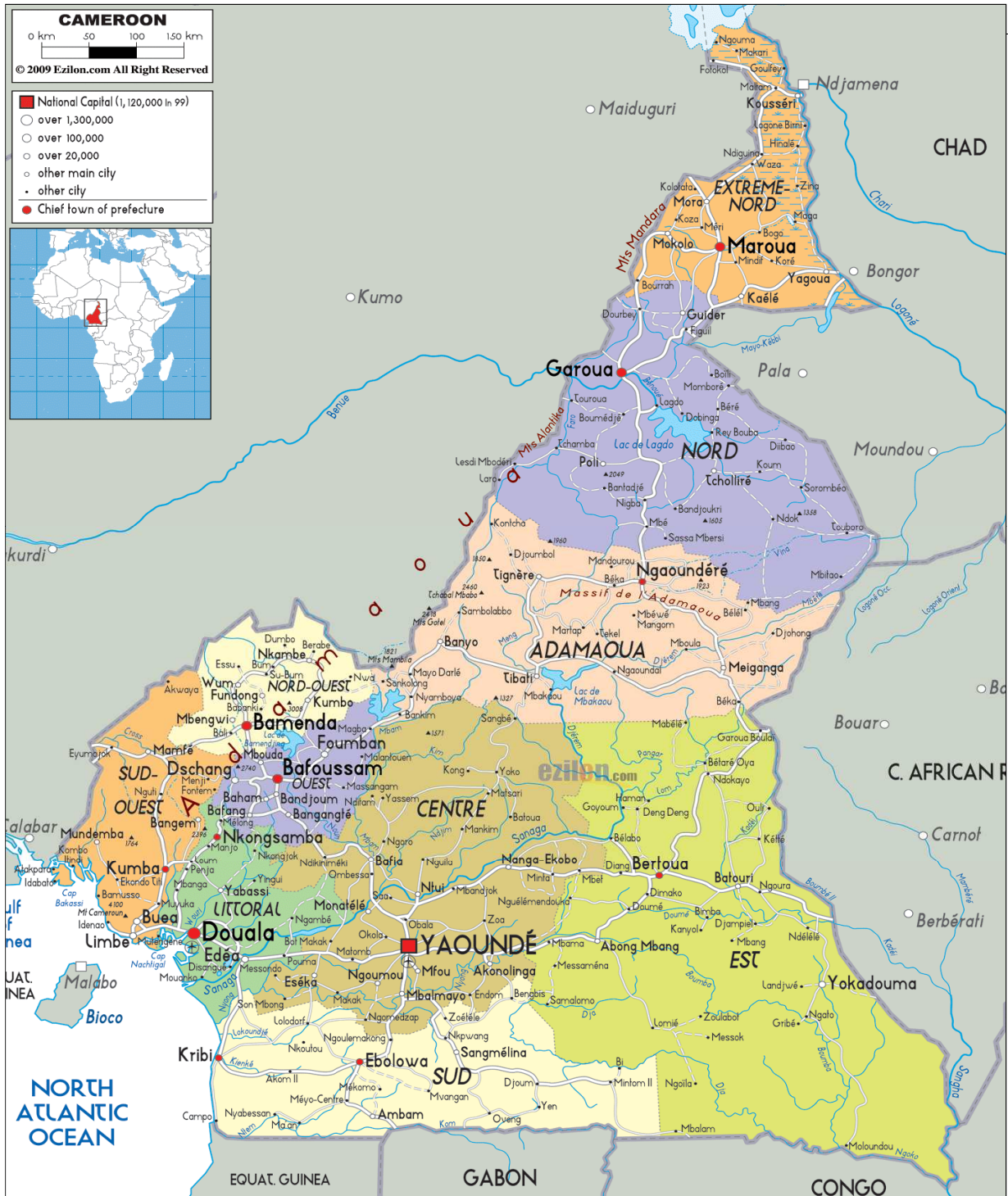
Appendix Figure 1: Map of Cameroon