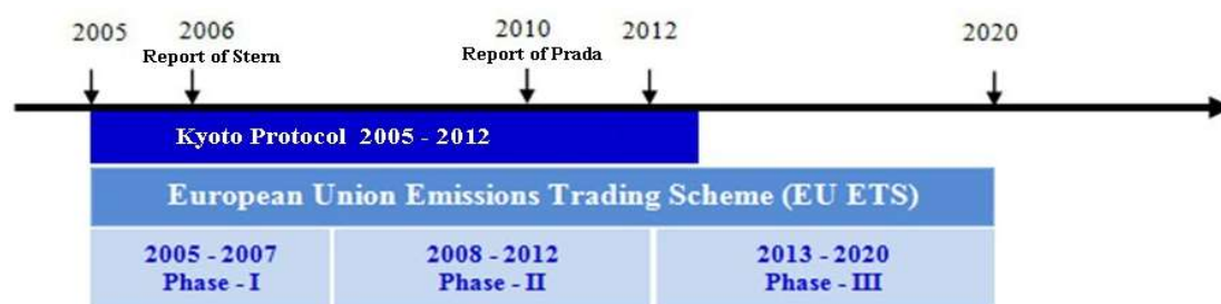
Figure 1. Overview of regulations governing carbon finance

Following this principle, it can be asserted that the real objective of the EU ETS to offer incentives to industrial firms to reduce their CO 2 emissions and thus encourage the adoption of low-carbon technologies, to develop Efficiency Energy (EE), Renewable Energies (Renewable Energies) and the low carbon economy (Capoor and Ambrosi, 2009). We give an overview of the regulations governing Carbon Finance (Bokenkamp, La Flash, Bachrach Wang, 2005).