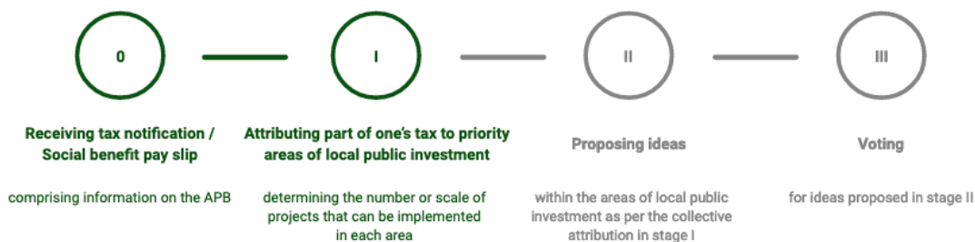
Figure 2: Additional elements in the advanced participatory budget in advance of the standard participatory budget stages.

Advanced PB has four stages, two of which are the same as in the classic PB mechanism (idea proposal and voting, stages II and III). The difference of the advanced PB is marked by two elements (stages 0 and I in green, Fig. 2) that precede the standard PB stages (in grey). As in PB, the various stages of the advanced PB are open to all citizens independently of their participation in the previous stages.