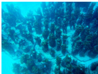
Fig. 1 : Jason de Caires Taylor, The Silent Evolution, Cancún Underwater Museum, 2010.