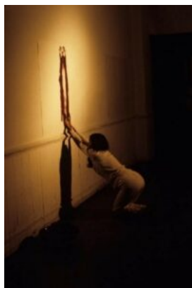
Fig. 5: Ana Mendieta, Siluetas , performance delivered on 4 Aug. 1982. Retrieved from https://library-artstor-org.bu-services.univ-antilles/fr/asset/AFURNACEIG_10310797082 (Creative Commons License authorization for republication).

Mendieta’s metaphysical relation to Itiba Cahubaba, the bleeding Mother-Earth of Taino cosmogony, coincides with the artist’s visceral connection to her native Cuba. It is worth mentioning that this deity plays a central role in empowering women. Interestingly enough, her influence spans from the Greater Antilles to the northern part of Guadeloupe. Rock art carvings from the Eastern Caribbean sites are scarce, but some were found on one of the river banks of Trois-Rivières. She is represented as a woman delivering a baby in the fluvial waters. Not only does she act benevolently towards mankind each time she presides over birth rituals, but she also guides women towards maturity and helps them to empower their womanhood in a male-dominated environment. Itiba Cahubaba/Yemaya/Mammy Wata is, from that standpoint, a progressive and inclusive archetype.