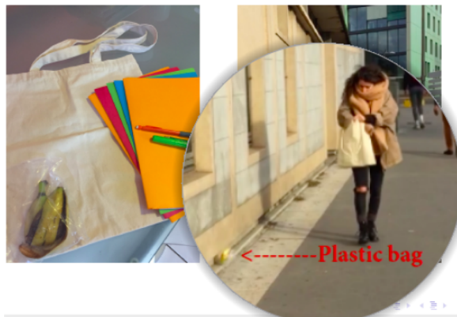
Figure A.1: Materials Used in the Experiment and Scenes