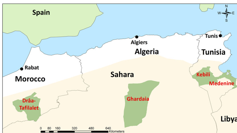
FIGURE 1 The three study areas [Colour figure can be viewed at wileyonlinelibrary.com ]

Our analysis of changes in LDOs considered two dimensions. The first is the organisations' fields of action: those defined at their creation and those defined later on. We analysed activities that provide direct services or support to