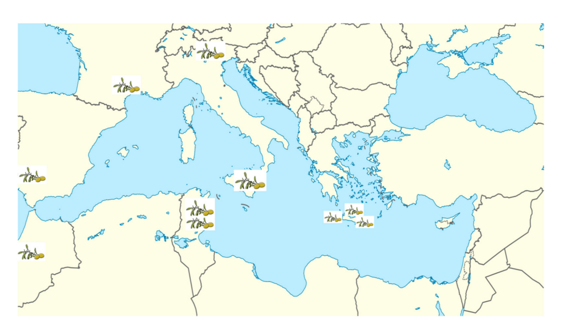
Figure 2. Location of the ten business cases studied.

Table 1. Main cultivation characteristics and olive oil production volumes in the six countries (based on [45]).