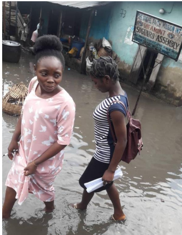
Figure 1 : Flooded Scene at Iwaya slum

portion of them ill. (Abdi et al. 2018, 2; Ssemugabo et al. 2021, 2). Ige and Nekhwevha (2014) stated that the overall living conditions in coastal slums pose a threat to residents' ability to participate in the economy, their health, and their general well-being.