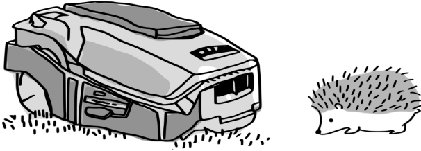
Fig. 3. Robots versus Hedgehogs. In Europe, various debates have emerged about the measures and actions to be taken in order to protect the small mammal from the robot lawn mower.

mowers, the populations have drastically reduced because of intensive agriculture, pesticides and motor traffic.