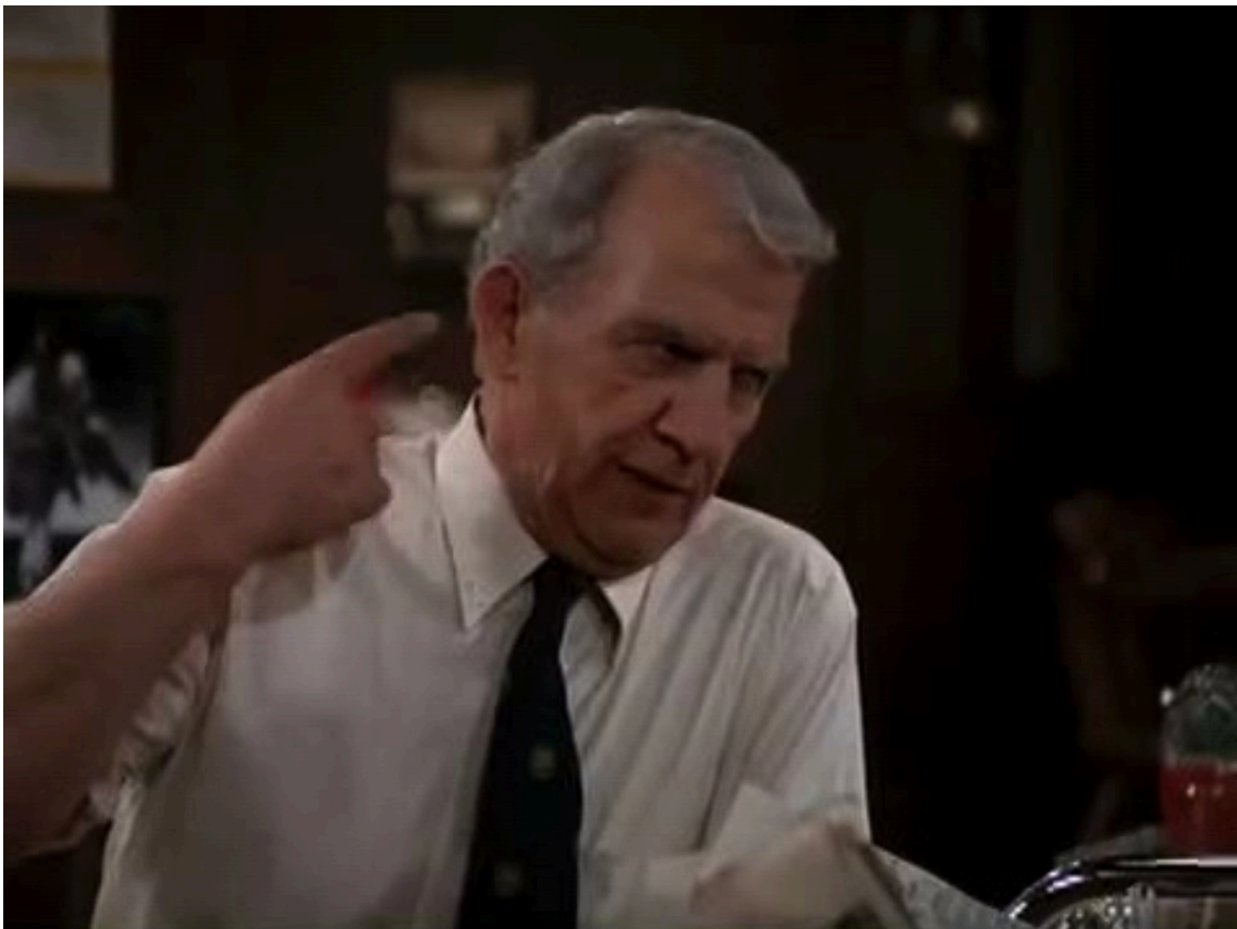
Figure 2: COACH. Say, Normie, aren't they a wonderful couple?

<Screengrab Fig. 2 – S2E15 Coach Aren't they a wonderful couple>