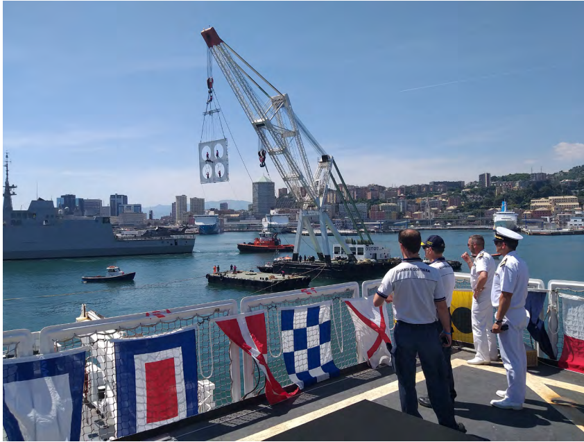
FIG. 3 Preparing the Orizzonti show: the Guard Coast on the Dattilo ship, the Mykonos crane with the acrobats, a tugboat, a mooring boat (ph: MEB), ZPGE19.

movement would contribute, highlighted by sound and light, to the creation of the choreography: pilots, moorers, tugs will be co-protagonists of the show [Fig. 2].