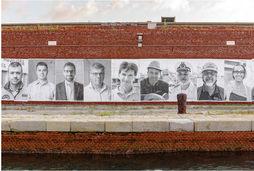
FIG. 1 Inside Out project on the port's dam, ZPGE18

were the occasion for observing the self-displaying discourse port workers made in a public situation, in front of a specific audience: something they never have the opportunity to do otherwise. Moreover, their discourse was directly submitted to questioning and even negotiating, and was forced to adapt depending on the different audiences, often attracted by the artistic proposal itself and hard to be involved without it. This dialogue revealed identitarian representations from both of the sides and moulded new forms of awareness of the port within the audiences: it contributed to develop a port-city culture that a pure scientific and "distant" enquiry would have produced just in theoretical, mediated terms and would not have easily shared with a large audience, even with the best purposes of dissemination.